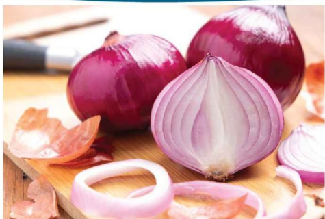
RED ITALIAN SWEET ONIONS jumbo