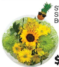
SWEET AND SPIKY BOUQUET