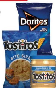
FRITO LAY TOSTITOS OR DORITOS CHIPS select varieties reg. $5.49; or