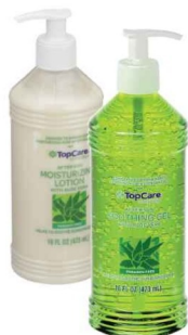
TOPCARE AFTER SUN CARE select varieties 16 oz.