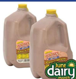
PLAINS DAIRY CHOCO DREAM gallon