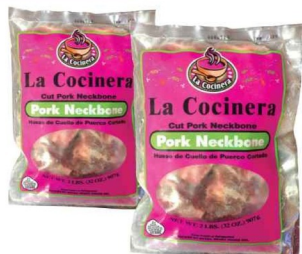
LA COCINERA PORK NECKBONES 2 lb. bag