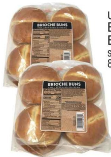
U.S. BAKERY BRIOCHE BUNS select varieties 8 ct.