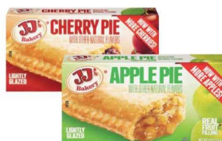
JJ'S BAKERY FRIED PIES select varieties 4 oz.