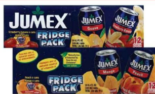
JUMEX FRIDGE PACK select varieties 12 pack 12 oz. cans