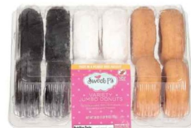
SWEET P'S VARIETY JUMBO DONUTS 12 ct.