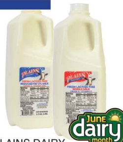
PLAINS DAIRY FRESH LACTOSE FREE MILK whole or reduced fat 2% 64 oz.