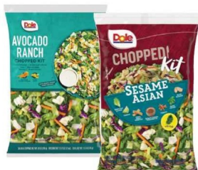
DOLE CHOPPED KITS select varieties 9.1-12.3 oz.