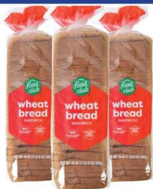
FOOD CLUB SANDWICH WHEAT BREAD 24 oz.