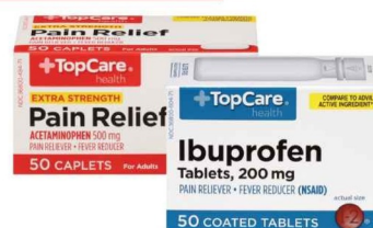
TOPCARE PAIN RELIEF acetaminophen or ibuprofen 50 ct.