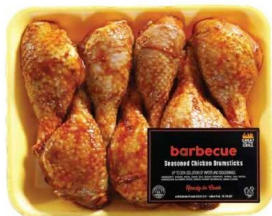
FRESH CUTS DRY RUB SEASONED DRUMSTICKS 5 flavors