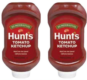
Hunt's Ketchup 32 oz.