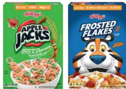
Kellogg's Cereal 8.8 - 12.6 oz.