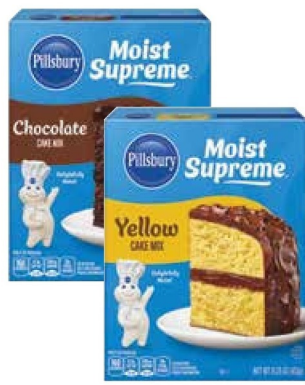
Pillsbury Cake Mix 15.25 oz.