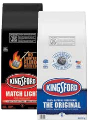
Kingsford Charcoal Briquets 12 - 16 Lb. Original or 12 Lb. Match Light