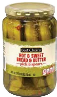
Best Choice Pickle Spears 24 oz.