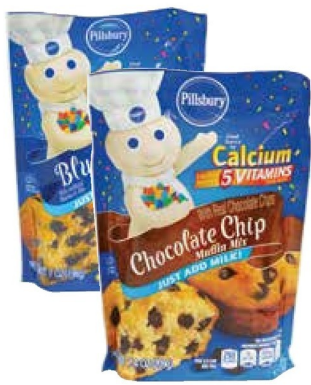
Pillsbury Muffin Mix 7 - 7.6 oz.