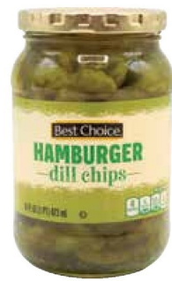
Best Choice Hamburger Dill Chips 16 oz.