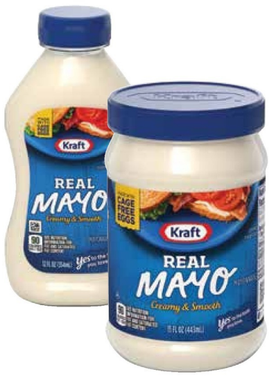
Kraft Mayo 12 - 15 oz.

Our selection of top-quality groceries along with Lincoln's widest range of specialty items makes Leon's perfect for everyday shoppers and foodies alike.