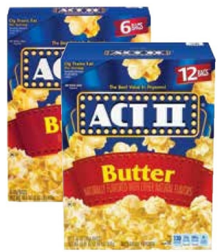
Act II Microwave Popcorn 6 - 12 Ct.