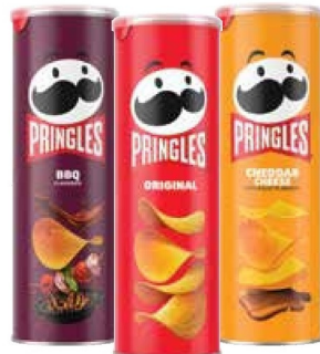
Pringles Mega Stack Potato Crisps 6.84 - 7.16 oz.