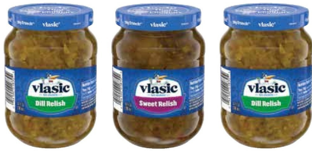
Vlasic Pickle Relish 10 oz.