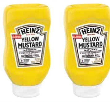
Heinz Yellow Mustard 14 oz.