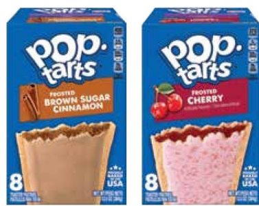
Pop-Tarts Toaster Pastries 5 - 8 Ct.