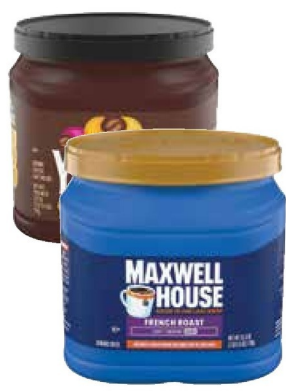
Maxwell House or Yuban Ground Coffee 23.1 - 27.9 oz.