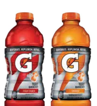
Gatorade 28 oz. Bottle