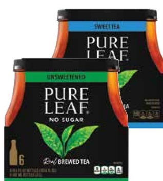
6 Pack Pure Leaf Tea 16.9 oz. Bottles