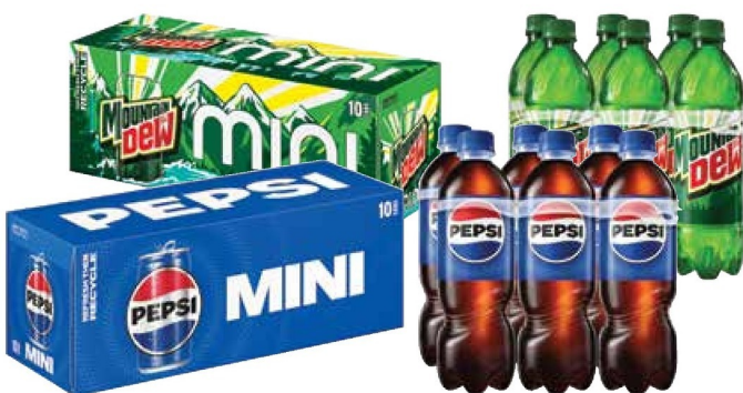
10 Pack Pepsi Products 7.5 oz. Cans