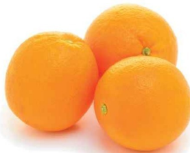
NAVEL ORANGES 4 lb. bag