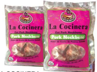
LA COCINERA PORK NECKBONES 2 lb. bag $4 49