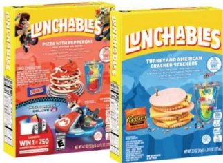
OSCAR MAYER FUN PACK LUNCHABLES select varieties 8.9-10.7 oz. 2/$5