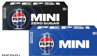
PEPSI PRODUCTS select varieties 10 pack 7.5 oz. mini cans