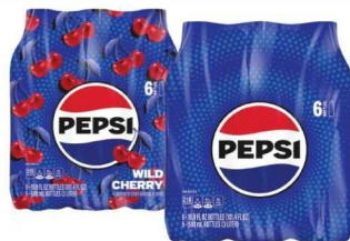
PEPSI PRODUCTS select varieties 6 pack 16.9 oz. btls.