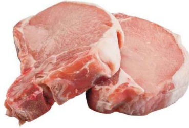
CENTER CUT PORK LOIN CHOPS bone-in $2 49 lb.