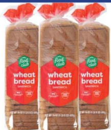
FOOD CLUB SANDWICH WHEAT BREAD 24 oz.