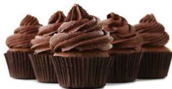
FRESH BAKED CUPCAKES assorted 6 ct.