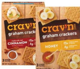
CRAV'N FLAVOR GRAHAM CRACKERS select varieties 14.4 oz.