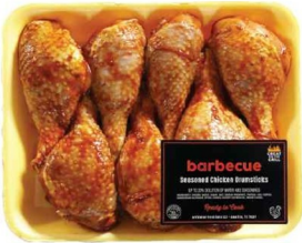
FRESH CUTS DRY RUB SEASONED DRUMSTICKS $1 49 lb.