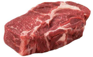
CHUCK ROAST boneless beef $5 99 lb.