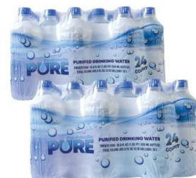
PANHANDLE PURE DRINKING WATER 24 pack 16.9 oz. btls.