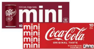
COCA-COLA PRODUCTS select varieties 10 pack 7.5 oz. mini cans