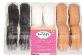
SWEET P'S VARIETY JUMBO DONUTS 12 ct.