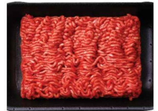
FRESH GROUND CHUCK $6 49 lb.