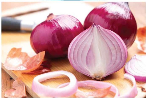
RED ITALIAN SWEET ONIONS jumbo