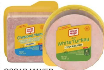
OSCAR MAYER LUNCH MEAT reg./honey chopped ham, ham & cheese loaf or oven roasted turkey $3 99 1 lb.