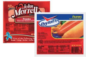
PEYTON'S OR JOHN MORRELL MEAT FRANKS 12 oz. $1 79