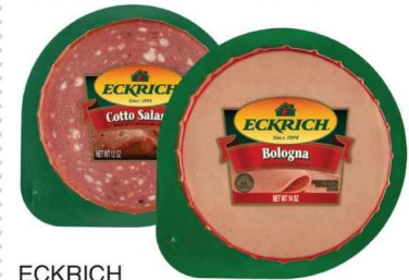
ECKRICH RED RIND BOLOGNA OR COTTO SALAMI 12-14 oz. 2/$6