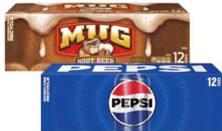
PEPSI PRODUCTS select varieties 12 pack 12 oz. cans