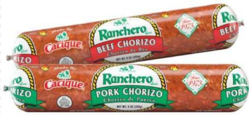
CACIQUE RANCHERO CHORIZO beef or pork 9 oz. 2/$3