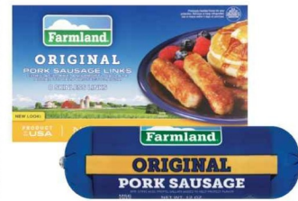
FARMLAND PORK SAUSAGE select varieties 8 oz. links or 12 oz. roll 2/$5