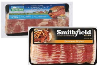
FARMLAND OR SMITHFIELD SMOKED BACON 12 oz. $4 79