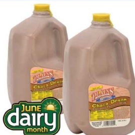
PLAINS DAIRY CHOCO DREAM gallon