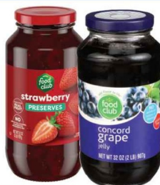
FOOD CLUB GRAPE JELLY OR STRAWBERRY PRESERVES 32 oz.