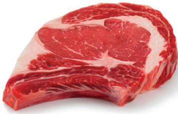
BEEF RIBEYE STEAK bone-in $10 99 lb.