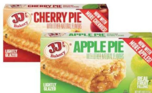
JJ'S BAKERY FRIED PIES select varieties 4 oz.