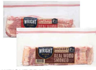
WRIGHT BRAND SMOKED BACON hickory, maple, or applewood 24 oz. $9 99