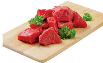
BEEF STEW MEAT $6 29 lb.