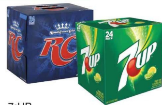
7•UP PRODUCTS select varieties 24 pack 12 oz. cans