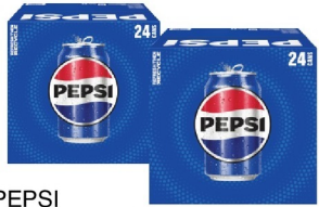
PEPSI PRODUCTS select varieties 24 pack 12 oz. cans