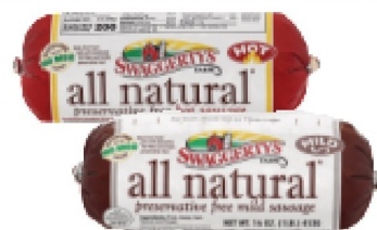
SWAGGERTY'S FARM SAUSAGE mild or hot 1 lb. roll