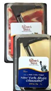
THE FATHER'S TABLE CHEESECAKE select varieties 2 pack