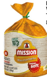
MISSION WHITE CORN TORTILLAS 80 ct.