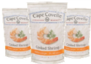
CAPE COVELLE COOKED SHRIMP p&d, tail-on 31/40 ct., 1 lb.