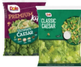
DOLE CAESAR SALAD KITS select varieties 10-11.3 oz.