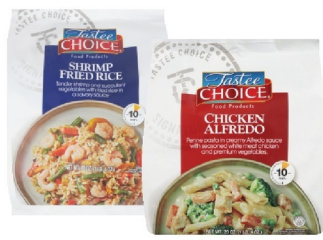
TASTEE CHOICE ENTREES select varieties 20 oz.