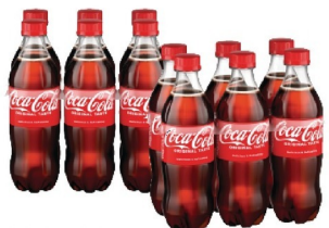
COCA-COLA PRODUCTS select varieties 6 pk., 16.9 oz.