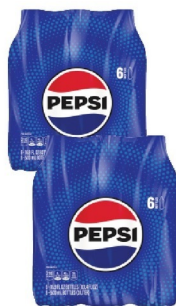
PEPSI PRODUCTS select varieties 6 pack 16.9 oz. btl.