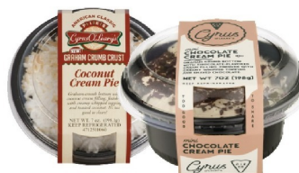
CYRUS O'LEARY'S MINI CREAM PIES select varieties 7 oz.