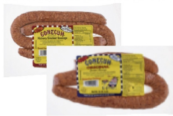
CONECUH SMOKED SAUSAGE select varieties 16 oz.