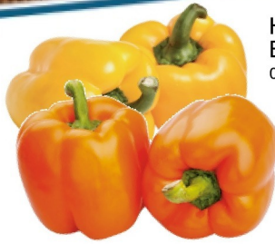
HOTHOUSE BELL PEPPERS orange or yellow