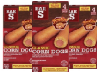
BAR S CLASSIC CORN DOGS 10.68 oz.