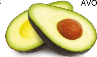
LARGE HASS AVOCADOS