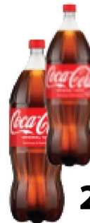
COCA-COLA PRODUCTS select varieties 2 liter btl.