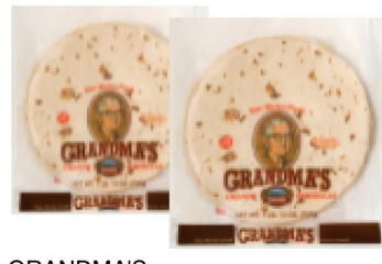
GRANDMA'S FLOUR TORTILLAS grande 10 ct.