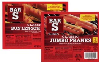
BAR S BUN LENGTH, CHICKEN, OR JUMBO MEAT FRANKS select varieties 1 lb.