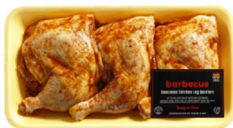
FRESH CUTS DRY RUB SEASONED LEG QUARTERS 4 flavors