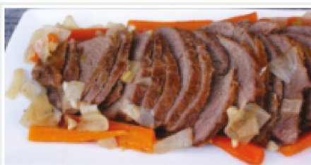
CHUCK TENDER ROAST preferred trim, boneless beef