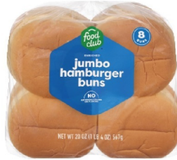
FOOD CLUB JUMBO HAMBURGER BUNS 8 ct.