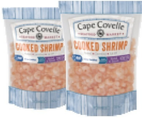
CAPE COVELLETTE COOKED SHRIMP p&d, tail-off 100/150 ct., 1 lb.