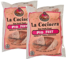
LA COCINERA PIG FEET 2 lb.