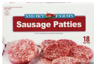
SMOKY FARMS SAUSAGE PATTIES 27 oz.