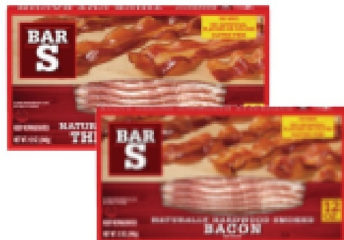
BAR S SLICED BACON regular or thick cut 12 oz.