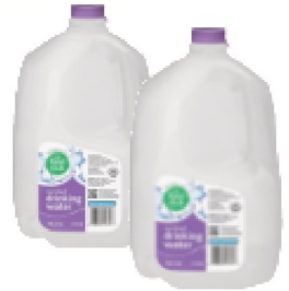
FOOD CLUB DRINKING WATER gallon