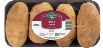
BASKET & BUSHEL BAKER POTATOES 4 ct. cell pack