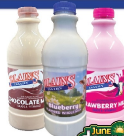
PLAINS DAIRY MILK seasonal blueberry, chocolate, or strawberry quart