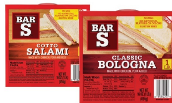
BAR S COTTO SALAMI OR MEAT BOLOGNA select varieties 1 lb.