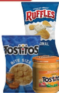
FRITO LAY RUFFLES OR TOSTITOS CHIPS select varieties reg. $5.49; or TOSTITOS OR LAY'S JAR DIPS select varieties 15-15.75 oz.