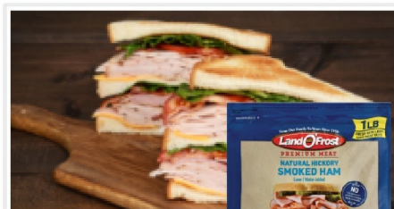
LAND O'FROST PREMIUM MEAT all varieties 15-16 oz.