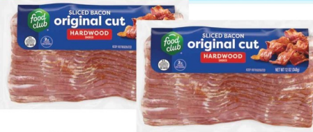
FOOD CLUB SMOKED SLICED BACON original cut 12 oz.