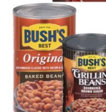
BUSH'S BEST BAKED OR GRILLIN' BEANS select varieties 22-28 oz.