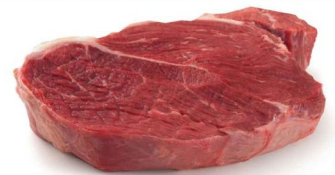
BEEF SHOULDER ROAST preferred trim boneless