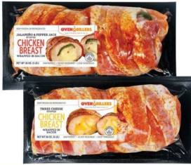
OVEN GRILLERS STUFFED CHICKEN BREAST jalapeno & pepper jack or 3 cheese 16 oz.