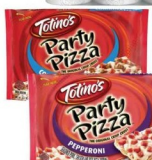
TOTINO'S PARTY PIZZA select varieties 9.8-10.9 oz.