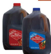
RED DIAMOND TEA select varieties 128 oz.