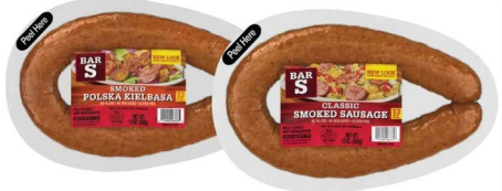
BAR S SMOKED SAUSAGE 13 oz. classic or polish