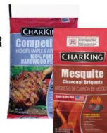
CHARKING CHARCOAL OR HARDWOOD PELLETS select varieties 15.4-20 lb.