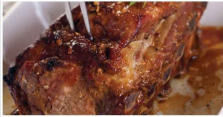
SIRLOIN END PORK ROAST fresh