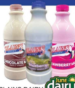
PLAINS DAIRY MILK seasonal blueberry, chocolate, or strawberry quart