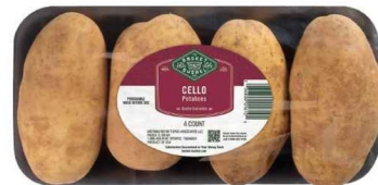
BASKET & BUSHEL BAKER POTATOES 4 ct. cell pack