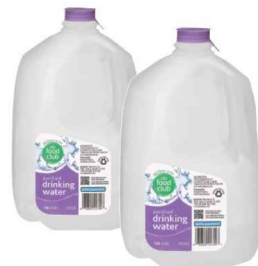
FOOD CLUB DRINKING WATER gallon