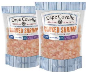
CAPE COVELLE COOKED SHRIMP p&d, tail-off 100/150 ct., 1 lb.