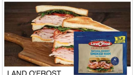
LAND O'FROST PREMIUM MEAT all varieties 15-16 oz.