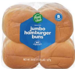
FOOD CLUB JUMBO HAMBURGER BUNS 8 ct.