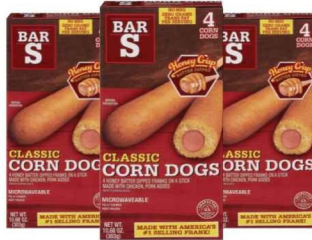
BAR S CLASSIC CORN DOGS 10.68 oz.