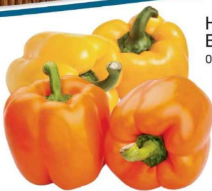
HOTHOUSE BELL PEPPERS orange or yellow