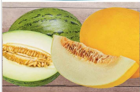
SANTA CLAUS OR CANARY MELONS