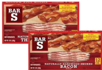
BAR S SLICED BACON regular or thick cut 12 oz.