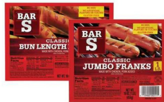
BAR S BUN LENGTH, CHICKEN, OR JUMBO MEAT FRANKS select varieties 1 lb.