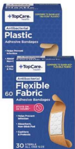
TOPCARE BANDAGES select varieties 10-60 ct.