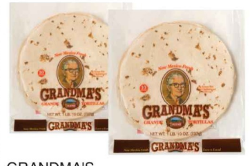
GRANDMA'S FLOUR TORTILLAS grande 10 ct.