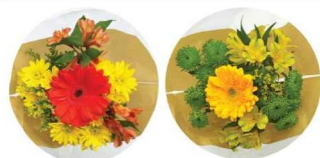
SUMMERTIME SORBET BOUQUET select varieties