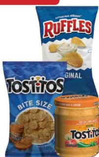
FRITO LAY RUFFLES OR TOSTITOS CHIPS select varieties reg. $5.49; or TOSTITOS OR LAY'S JAR DIPS select varieties 15-15.75 oz.