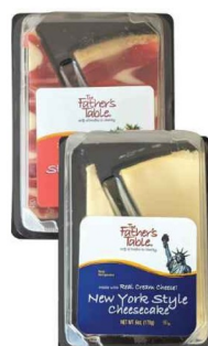
THE FATHER'S TABLE CHEESECAKE select varieties 2 pack