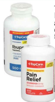
TOPCARE PAIN RELIEF acetaminophen or ibuprofen 500 ct.