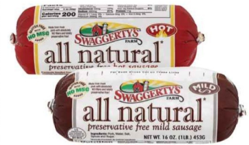
SWAGGERTY'S FARM SAUSAGE mild or hot 1 lb. roll

$4 99 When You Buy 1 With Digital Coupon