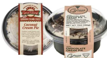
CYRUS O'LEARY'S MINI CREAM PIES select varieties 7 oz.