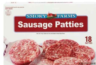
SMOKY FARMS SAUSAGE PATTIES 27 oz.