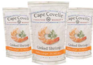
CAPE COVELLE COOKED SHRIMP p&d, tail-on 31/40 ct., 1 lb.