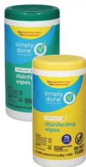
SIMPLY DONE DISINFECTING WIPES lemon or fresh scent 75 ct.