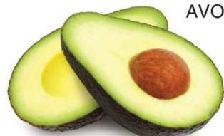
LARGE HASS AVOCADOS