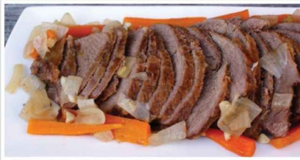
CHUCK TENDER ROAST preferred trim, boneless beef $6 99 lb. CHUCK TENDER STEAK preferred trim, boneless beef . . . $7.29 lb.