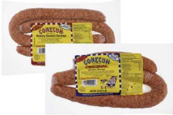
CONECUH SMOKED SAUSAGE select varieties 16 oz.