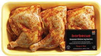
FRESH CUTS DRY RUB SEASONED LEG QUARTERS 4 flavors