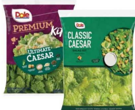
DOLE CAESAR SALAD KITS select varieties 10-11.3 oz.