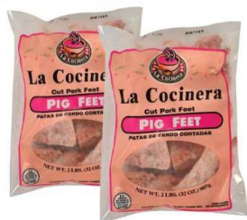
LA COCINERA PIG FEET 2 lb.