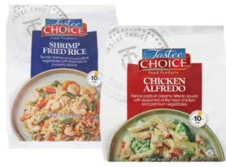
TASTEE CHOICE ENTREES select varieties 20 oz.