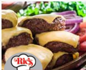
Ric's Signature Ground Beef 5.99 LB