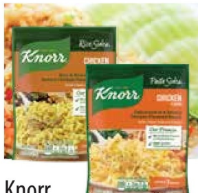
Knorr Pasta or Rice Sides 4-5.7 oz. 4/$5