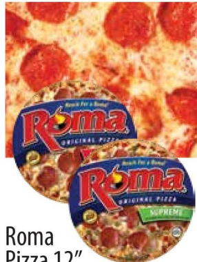
Roma Pizza 12" 2/$5