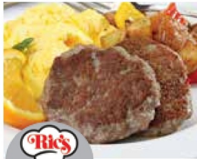
Ric's Signature Bulk Breakfast Sausage 2.99 LB