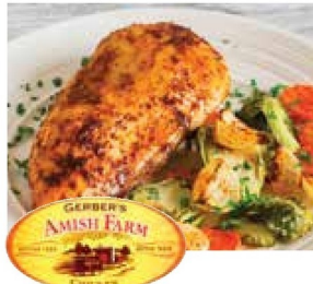
Gerber Boneless Skinless Chicken Breast 6.29 LB