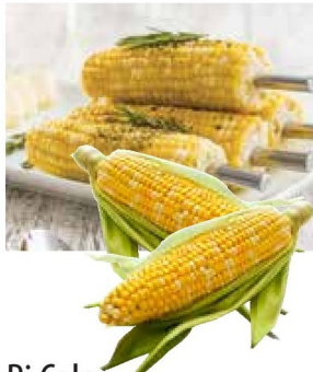
Bi Color Sweet Corn 5/$3