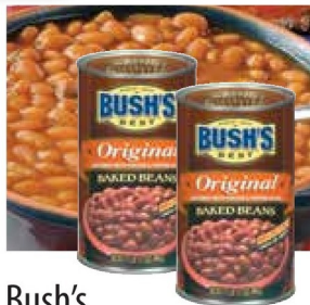
Bush's Baked Beans 22-28 oz. 2/$5