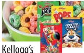
Kellogg's Frosted Flakes 12 oz. Fruit Loops 8.9 oz. Rice Krispies 9 oz. Apple Jacks 8.9 oz. Corn Pops 8.8 oz. Cocoa Krispies 12.6 oz. 2/$6

MONDAY, JUNE 15TH - SUNDAY, JUNE 21ST, 2026