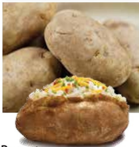
Russet Baking Potatoes. 49¢ LB