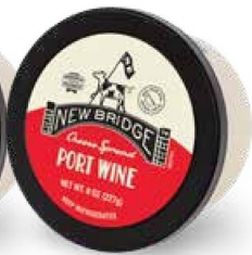
NEW BRIDGE CHEESE SPREAD