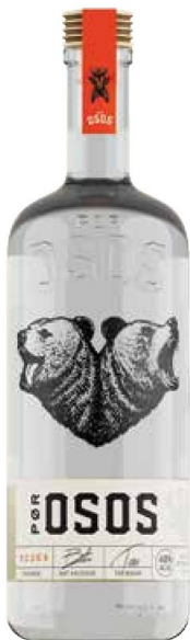
WOODFORD RESERVE DISTILLER'S SELECT 750 mL