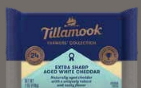
TILLAMOOK MAKER'S RESERVE EXTRA SHARP CHEDDAR CHEESE AGED 3 YEARS