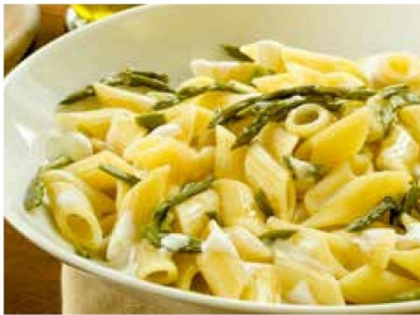
STAGE DOOR DELI LEMON & RICOTTA ASPARAGUS PASTA SALAD