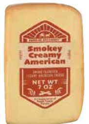
SUNRISE CREAMERY DILLY PICKLE OR CREAMY SMOKED AMERICAN CHEESE