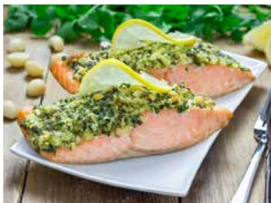
STAGE DOOR DELI ROCKEFELLER SALMON FILLETS