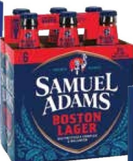
6 PACK SAM ADAMS OR DOGFISH HEAD 12 oz. Cans or Bottles