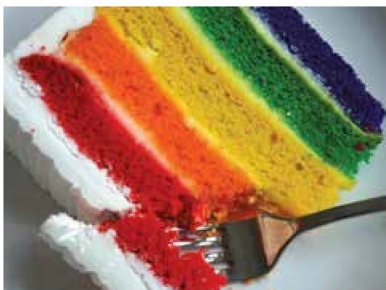
STAGE DOOR DELI RAINBOW VELVET CAKE SLICE