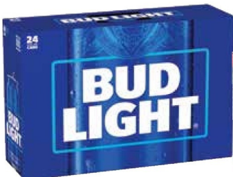
24 PACK BUDWEISER OR BUD LIGHT 12 oz. cans