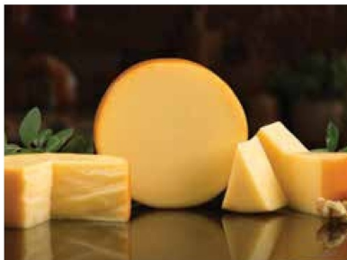
BOAR'S HEAD SMOKED GOUDA