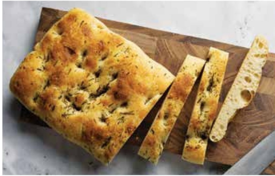
IZZIO GARLIC ROSEMARY FOCACCIA Loaf

One of Lincoln's first in-store delis, Leon's provides only the finest Boar's Head meats and cheeses, along with delicious ready-to-eat items from our hot case.