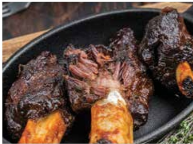
STAGE DOOR DELI RASPBERRY CHIPOTLE BRAISED SHORT RIBS