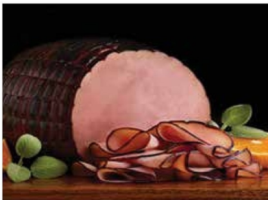
BOAR'S HEAD HONEY MAPLE HAM