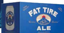
6 PACK NEW BELGIUM 12 oz. Cans or Bottles