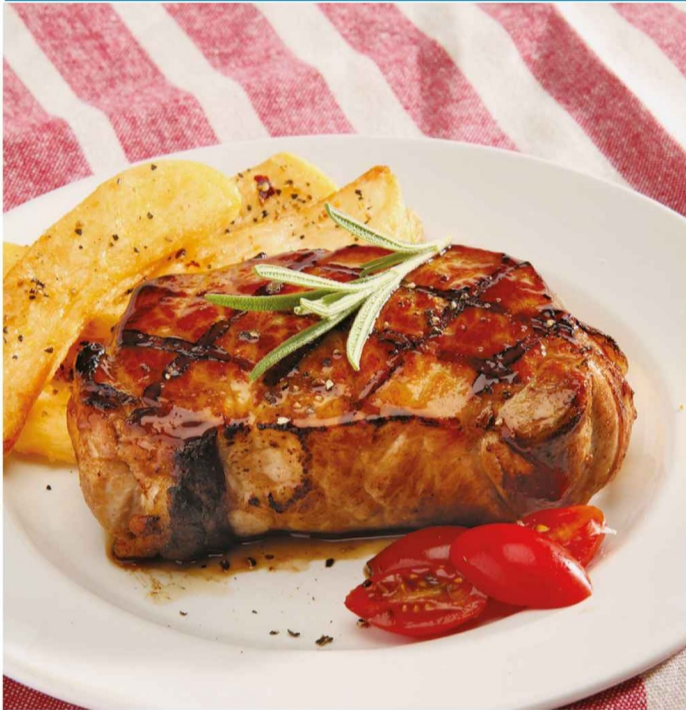
Family Pack Boneless Pork Chops

Pricing: We price product at cost and add 10% at the checkout. Cost is getting product from the warehouse, labor, and overhead to our shelves. Compare our prices and save.