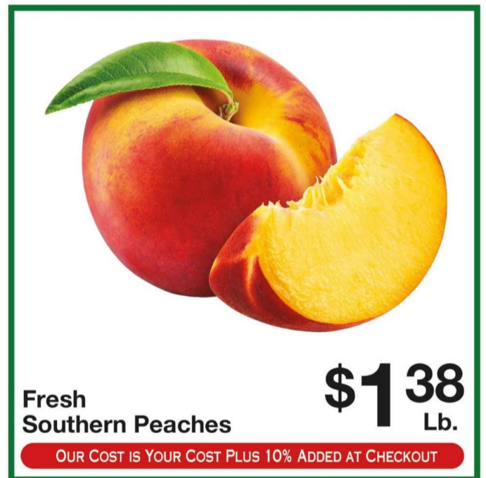
Fresh Southern Peaches

OUR COST IS YOUR COST PLUS 10% ADDED AT CHECKOUT