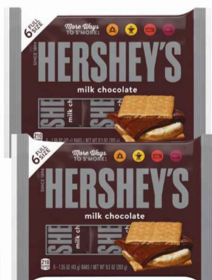
$721 6 Ct. Hershey's Milk Chocolate Candy Bars