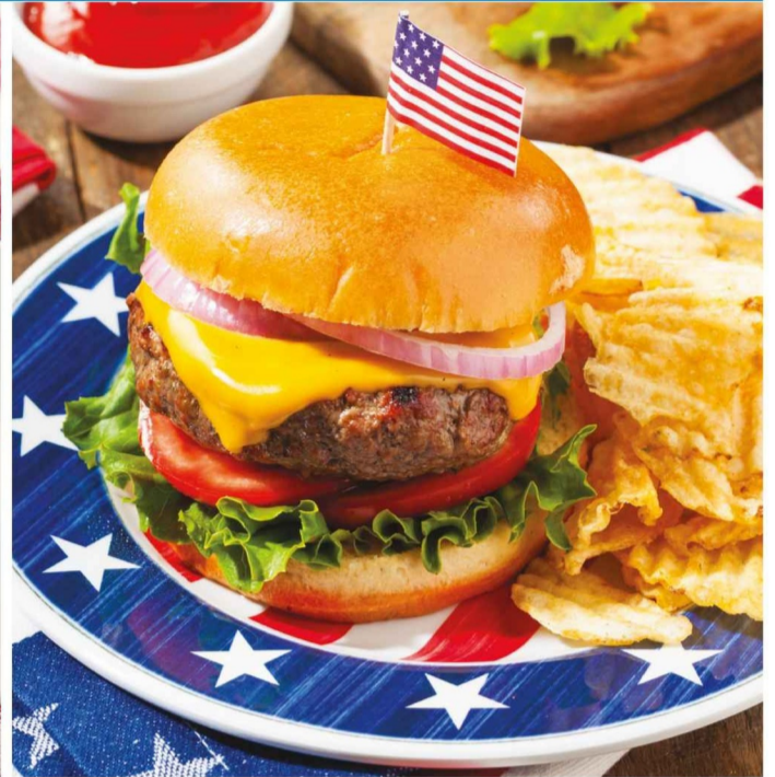
Family Pack Fresh 80% Lean Ground Chuck

OUR COST IS YOUR COST PLUS 10% ADDED AT CHECKOUT