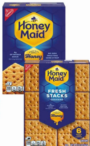
$363 12.2-14.4 Oz. Nabisco Honey Maid Graham Crackers