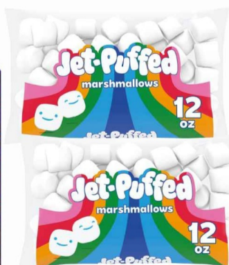
$182 12 Oz. Kraft Jet Puffed Marshmallows