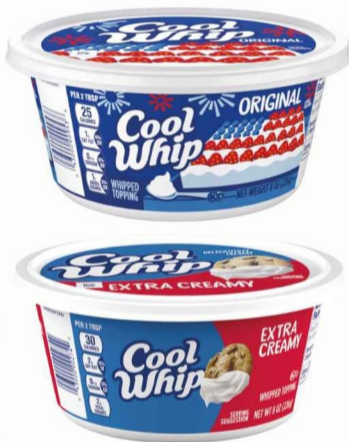
$182 8 Oz. Cool Whip Whipped Topping