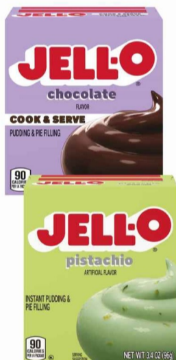
$113 0.3-3.9 Oz. Jell-O Gelatin Or Pudding Mix