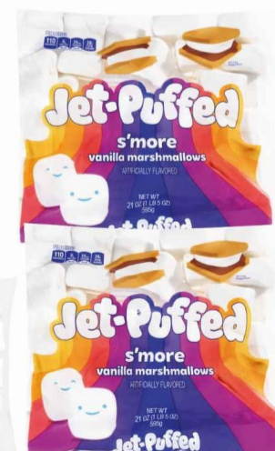
$272 21 Oz. Kraft S'mores Marshmallows