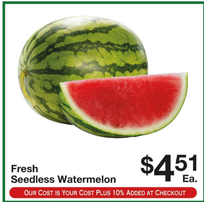
Fresh Seedless Watermelon

OUR COST IS YOUR COST PLUS 10% ADDED AT CHECKOUT