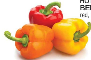
HOTHOUSE BELL PEPPERS red, orange or yellow