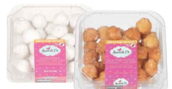
SWEET P'S DONUT HOLES select varieties 12-14 oz.