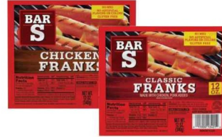
BAR S CHICKEN OR MEAT FRANKS select varieties 12 oz.