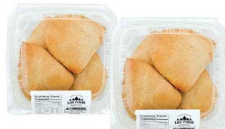
LOS PINOS EMPANADAS select varieties 4 ct.