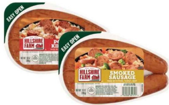
HILLSHIRE FARM SMOKED SAUSAGE select varieties 13-14 oz.