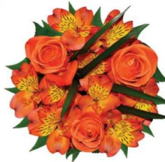
MONOCHROMATIC ROSE ALSTRO BOUQUET $8 99 ea.