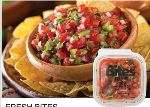
FRESH BITES PICO DE GALLO 14 oz.