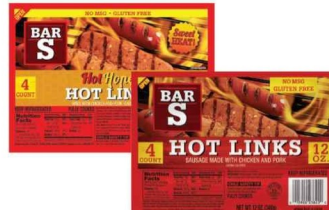
BAR S HOT LINKS regular or hot honey 12 oz.