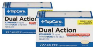
TOPCARE DUAL ACTION acetaminophen & ibuprofen 72 ct.