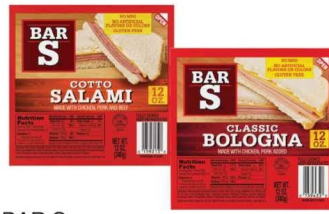
BAR S COTTO SALAMI OR BOLOGNA select varieties 12 oz.