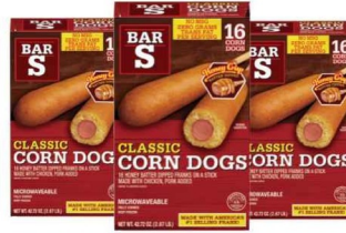
BAR S CLASSIC CORN DOGS 2.67 lb. box