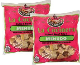
LA COCINERA MENUDO cubed beef tripe 4 lb. bag