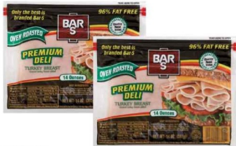
BAR S PREMIUM DELI OVEN ROASTED TURKEY BREAST 14 oz.