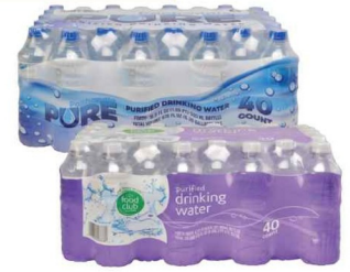
FOOD CLUB OR PANHANDLE PURE DRINKING WATER 40 pack 16.9 oz. btl.