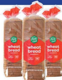
FOOD CLUB SANDWICH WHEAT BREAD 24 oz.