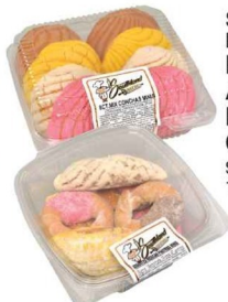
SOUTHLAND BAKING CO. BOLILLO ROLLS, ASSORTED MINI PASTRIES, OR CONCHAS select varieties 12 oz. or 12 ct.