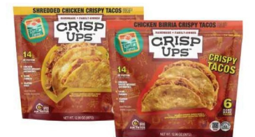
DON LEE FARMS CRISP UPS CRISPY TACOS select varieties 8.96-12.96 oz.