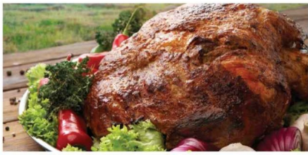
"BOSTON BUTT" PORK ROAST fresh