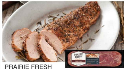
PRAIRIE FRESH MARINATED PORK TENDERLOINS teriyaki or rotisserie 18.4 oz.