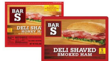
BAR S DELI SHAVED HAM select varieties 9 oz.