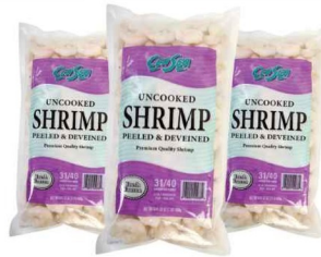
CENSEA RAW SHRIMP p&d tail off 31/40 ct. sold in a 2 lb. bag for $15.98