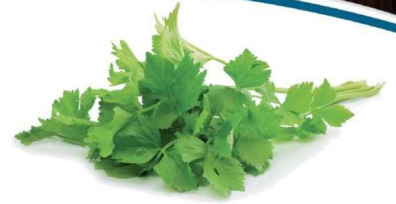
FRESH BUNCH CILANTRO