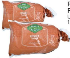
BASKET & BUSHEL RUSSET POTATOES U.S. #1 10 lb. bag