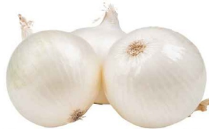
JUMBO WHITE ONIONS