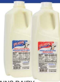
PLAINS DAIRY FRESH LACTOSE FREE MILK whole or reduced fat 2% 64 oz.