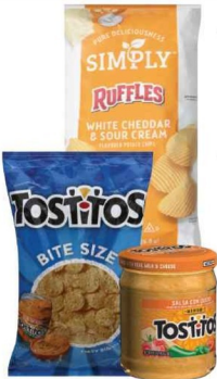
FRITO LAY TOSTITOS OR SIMPLY CHIPS select varieties reg. $3.99-$5.49; or