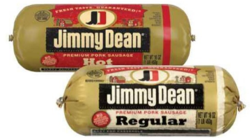
JIMMY DEAN PREMIUM PORK SAUSAGE select varieties 1 lb. roll