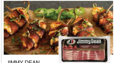
JIMMY DEAN BACON hickory or applewood 12 oz.