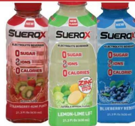
SUERO-X ELECTROLYTE BEVERAGE select varieties 21.3 oz.