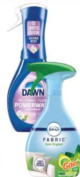
FEBREEZE FABRIC REFRESHER select varieties 23.6 oz; or