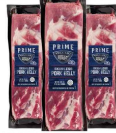
PRIME VILLARI SKINLESS PORK BELLY 24 oz.