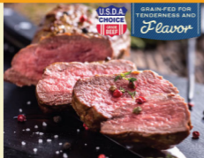
Fresh, Boneless U.S.D.A. Choice Beef Eye of Round Steak