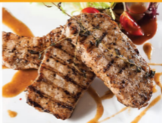
Fresh, Boneless Pork Sirloin Chops

Remove the steaks from the oven and let them rest, covered, for 10-15 minutes. Slice thinly against the grain and serve with the pan juices, onions, and garlic spooned over the top.