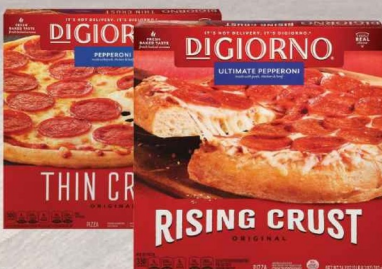
Digiorno Rising or Thin Crust Pizza Select Varieties 16.9-29.3 oz.