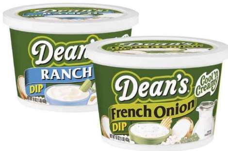
Dean's Dips Select Varieties 12-16 oz.