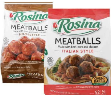
Rosina Meatballs Select Varieties 18-26 oz.