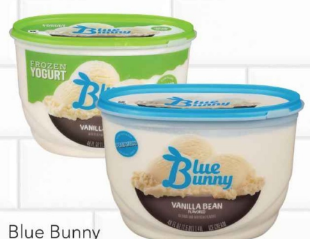
Blue Bunny Ice Cream or Frozen Yogurt Select Varieties 46-48 oz.