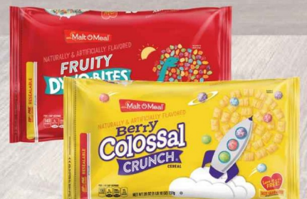
Malt O Meal Cereal Select Varieties 23-30 oz.