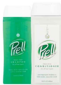
Prell Shampoo or Conditioner Select Varieties 12-13.5 oz.