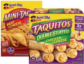
Jose Ole Mini Beef Tacos or Taquitos Select Varieties 16.2-22.5 oz.