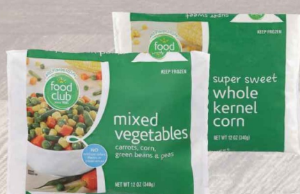
Food Club Vegetables Select Varieties 12 oz.