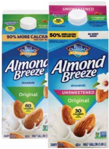
Almond Breeze Almondmilk Select Varieties 64 oz.