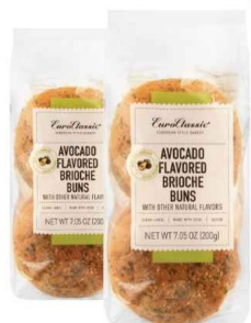
Euro Classic Brioche Buns Select Varieties 7.05 oz.