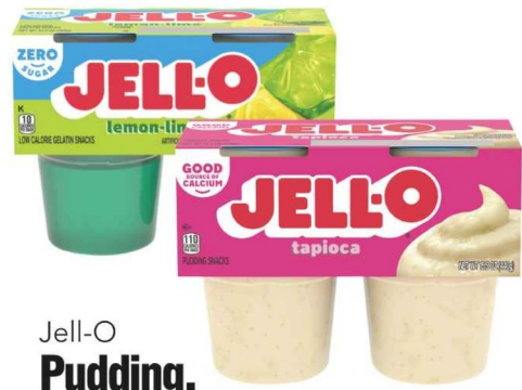
Jell-O Pudding, Gelatin or Temptations Select Varieties 4 pk.