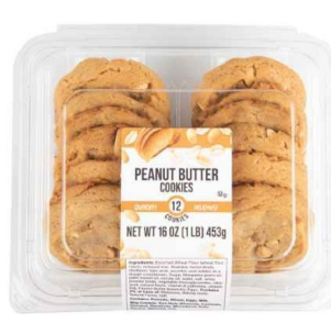
English Bay Cookies Peanut Butter or Sugar 12 ct.