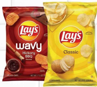
Lay's Potato Chips Select Varieties p.p. $4.29