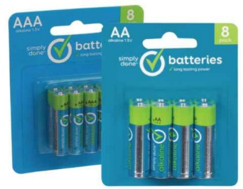
Simply Done Batteries AA or AAA 8 pk.