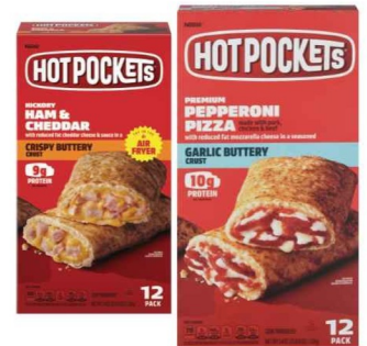
Hot Pockets Select Varieties 12 ct.