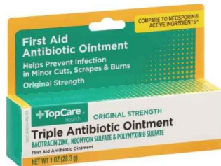
TopCare Triple Antibiotic Ointment Original Strength 1 oz.