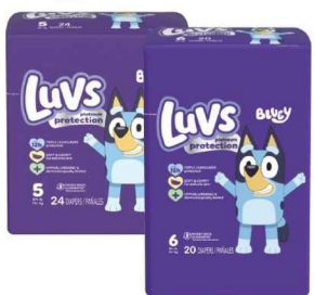
Luvs Platinum Protection Diapers Sizes 1-6 20-46 ct.