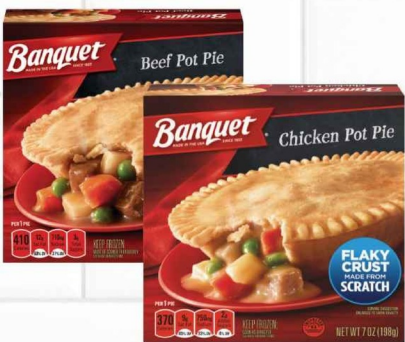
Banquet Pot Pies Select Varieties 7 oz.