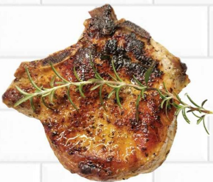
Dubuque Smoked Pork Chops