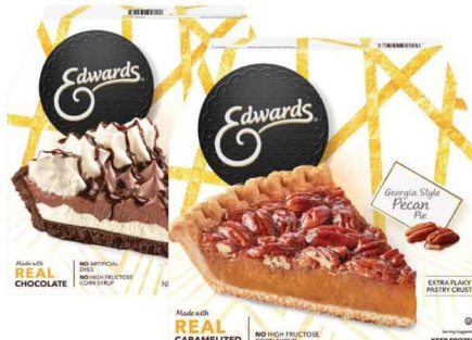
Edwards Pies Select Varieties 24-32 oz.