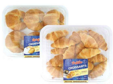
Cafe Valley Croissants Petite or Large 6-15 ct.