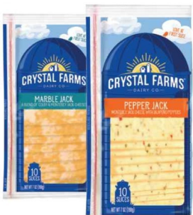
Crystal Farms Cheese Slices Select Varieties 6-7 oz.