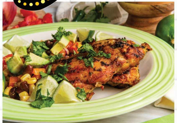
Boneless Skinless Thighs family pk.