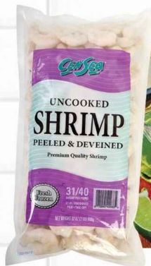
Censea Raw Shrimp 31/40 ct., p&d, tail off sold in a 2 lb. bag for $13.98