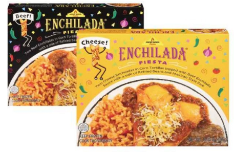
Night Hawk Dinners Select Varieties 6-11.1 oz.