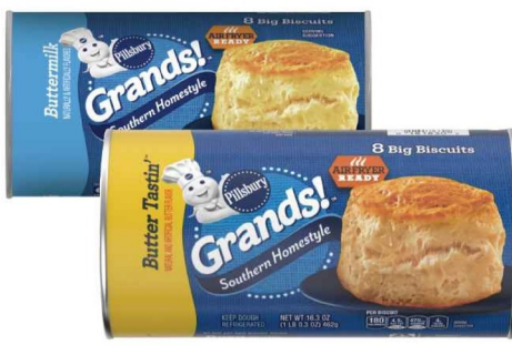
Pillsbury Grands! Biscuits Select Varieties 16.3 oz.