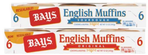
Bays English Muffins Select Varieties 6 pk.