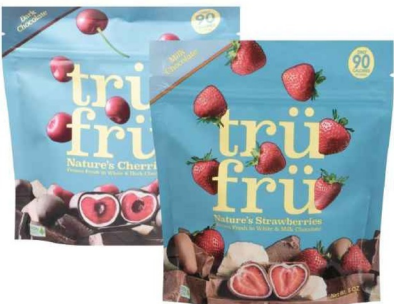
Tru Fru Dipped Fruit Select Varieties 8 oz.