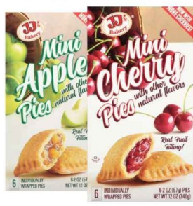
JJ's Bakery Mini Snack Pies Apple or Cherry 6 ct.