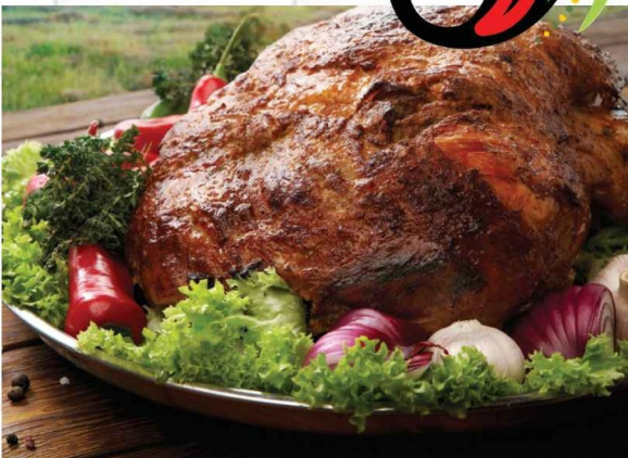
"Boston Butt" Pork Roast Fresh