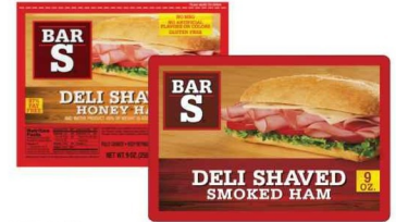
BAR S DELI SHAVED HAM select varieties 9 oz.