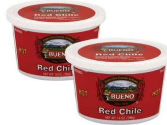
BUENO RED CHILE 14 oz.