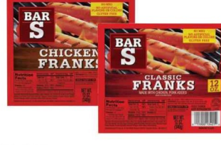
BAR S CHICKEN OR MEAT FRANKS select varieties 12 oz.