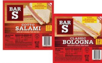
BAR S COTTO SALAMI OR BOLOGNA select varieties 12 oz.