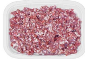
GROUND PORK CHILI MEAT