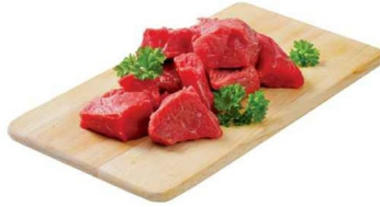
BEEF STEW MEAT