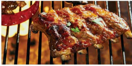
PORK SPARE RIBS