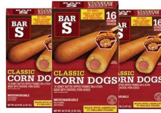
BAR S CLASSIC CORN DOGS 2.67 lb. box