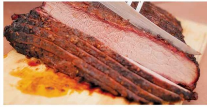
BEEF BRISKET packer trim