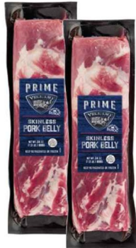
PRIME VILLARI SKINLESS PORK BELLY 24 oz.