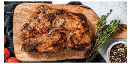
FRESH PORK STEAK