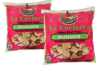
LA COCINERA MENUDO cube beef tripe 4 lb. bag