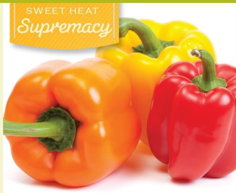
Fresh Red, Yellow or Orange Bell Peppers

Out-of-this-world crunch and perfectly balanced sweetness—Cosmic Crisp Apples are juicy, crisp, and bursting with flavor in every bite! Side effects may include judging all other apples harshly.