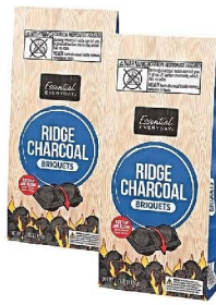
Essential Everyday Ridge Charcoal Briquets 7.7 lb. Bag