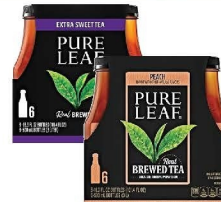
Lipton Pure Leaf Brewed Tea