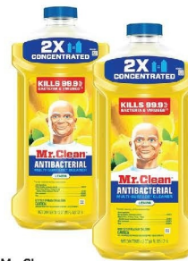
Mr. Clean Antibacterial Liquid Cleaner 41 oz. Bottle