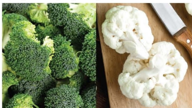
Fresh Broccoli or Cauliflower

Remove from the grill and serve hot with lemon wedges on the side.