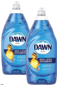
Dawn Liquid Dish Soap 38 oz. Bottle