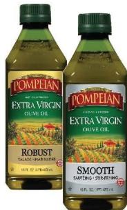
Pompeian Olive Oil Selected Varieties 16 oz. Bottle