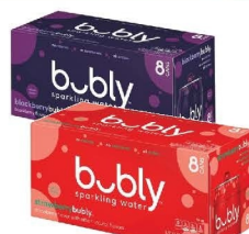
Bubly Sparkling Water