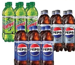
Pepsi 6 Pack