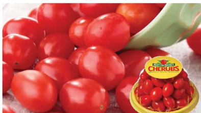
Nature Sweet Cherubs Grape Tomatoes

Whether you choose cauliflower or broccoli, you're picking a nutrient-rich vegetable that delivers clean, wholesome goodness in every bite.