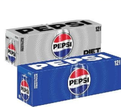
Pepsi 12 Pack