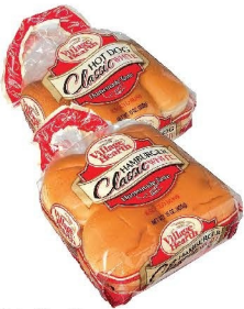
Village Hearth Hamburger or Hot Dog Buns Selected Varieties 8 Count Package