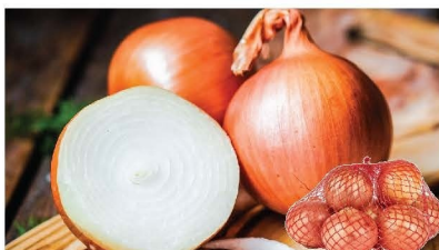
USA Medium Yellow Onions

After eating just one of these tiny and tasty tomatoes, you'll understand why they're so addictive. Perfect for snacking, appetizer platters, and roasting, for homemade tomato sauces.