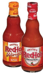
Frank's Red Hot Sauce Selected Varieties, 12 oz. Bottle