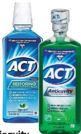
ACT Anticavity Adults, Kids or Restoring Rinse Selected Varieties 16.9-18 oz. Bottle