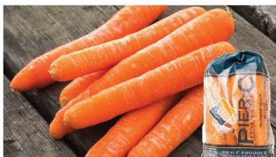
Pier-C Cello Carrots

Yellow onions are the secret to rich, savory flavor that makes every dish taste like it's been cooking all day. Chop one up and suddenly you're crying in the kitchen like you're in a dramatic cooking show.