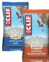
Clif Energy Bar Selected Varieties 2.4 oz. Package