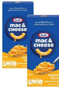
Kraft Macaroni & Cheese 7.25 oz. Box