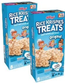
Kellogg's Rice Krispie Treats 8 Count Box