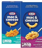
Kraft Flavored Macaroni & Cheese Selected Varieties, 5.5-7.25 oz. Box