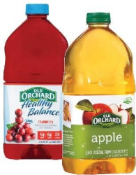
Old Orchard Juice Blends Selected Varieties, 64 oz. Bottle