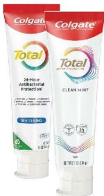
Colgate Total Toothpaste Selected Varieties 5.1 oz. Tube