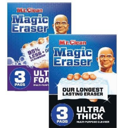
Mr. Clean Ultra Magic Eraser Selected Varieties 3 Count Package