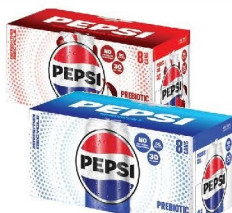
Pepsi Prebiotic Cola