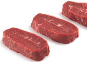
TOP BLADE STEAK boneless beef