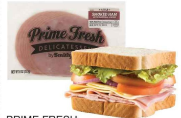
PRIME FRESH LUNCH MEAT select varieties 7-8 oz.