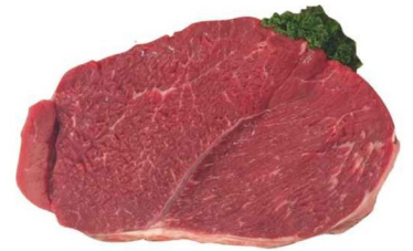
CHARCOAL SHOULDER STEAK boneless beef