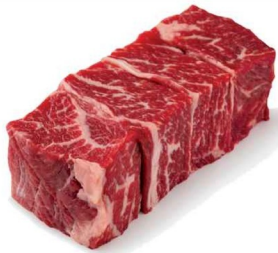
SHORT RIBS boneless beef