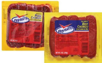
PEYTON'S CHORIZO beef or pork 8 oz.