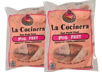
LA COCINERA PIG FEET 2 lb.