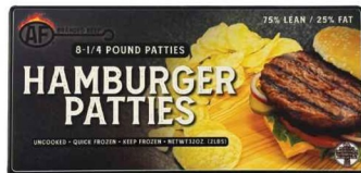
AF BRANDED BEEF HAMBURGER PATTIES 2 lb. box