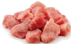
PORK STEW MEAT