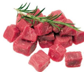
BEEF STEW MEAT