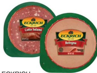
ECKRICH COTTO SALAMI OR BOLOGNA 12-14 oz.