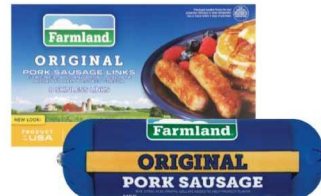
FARMLAND PORK SAUSAGE select varieties 8 oz. links or 12 oz. rolls