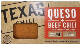
TEXAS CHILI QUESO + BEEF CHILI 14 oz.