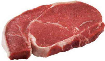
TOP SIRLOIN STEAK boneless beef