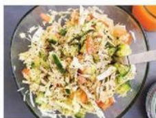
STAGE DOOR DELI MEDITERRANEAN COLE SLAW