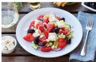
STAGE DOOR DELI GREEK SALAD

One of Lincoln's first in-store delis, Leon's provides only the finest Boar's Head meats and cheeses, along with delicious ready-to-eat items from our hot case.