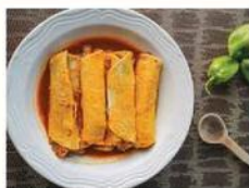
STAGE DOOR DELI GRAB & GO PULLED PORK ENCHILADA