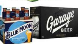
6 PACK BLUE MOON