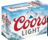
24 PACK COORS LIGHT