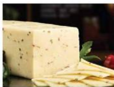
BOAR'S HEAD PEPPER JACK CHEESE