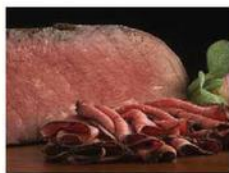
BOAR'S HEAD LONDON BROIL