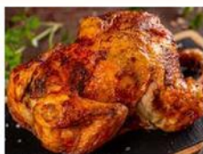
STAGE DOOR DELI GARLIC & HERB WHOLE ROASTED CHICKENS