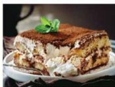
STAGE DOOR DELI TIRAMISU SLICE