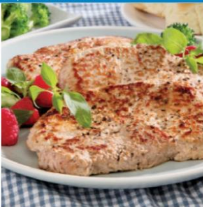
Family Pack Fresh Boneless Pork Sirloin Chops

OUR COST IS YOUR COST PLUS 10% ADDED AT CHECKOUT