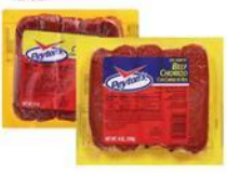
PEYTON'S CHORIZO 8 oz. pork or beef