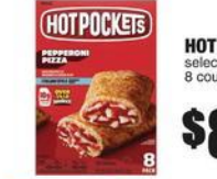
HOT POCKETS select varieties 8 count