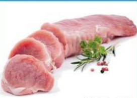
WHOLE PORK TENDERLOIN boneless