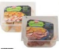
HORMEL SNACK TRAYS select varieties 14 oz.