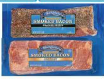
BLUE RIBBON STACK PACK BACON 24 oz. hickory or peppered