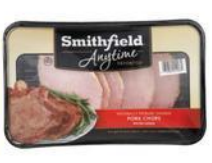
SMITHFIELD ANYTIME HICKORY SMOKED PORK CHOPS 17 oz.