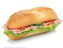
PRIME FRESH LUNCH MEAT select varieties 7-8 oz.