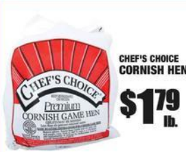
CHEF'S CHOICE CORNISH HEN