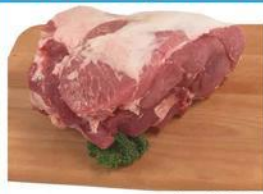
FRESH SIRLOIN END PORK ROAST