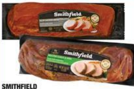
SMITHFIELD MARINATED PORK TENDERLOIN OR LOIN select varieties 18.4-23.02 oz.