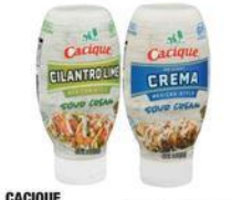
CACIQUE CREMA 12 oz. original, cilantro lime or picante