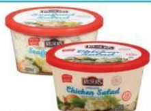
RESER'S MEAT DELI SALAD 12 oz. ham, chicken or seafood