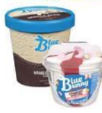
BLUE BUNNY ICE CREAM OR ICE CREAM SUNDAE select varieties 5.5-14 oz.