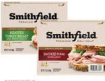
SMITHFIELD PREMIUM DELI MEAT select varieties 12 oz.