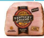
KENTUCKY LEGEND HAMS whole, quarter or sliced quarter