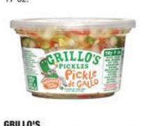
GRILLO'S PICKLE DE GALLO 14 oz. medium or hot