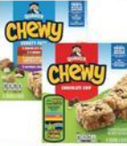
QUAKER CHEWY GRANOLA BARS select varieties 8 count