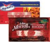
PEYTON'S SLICED BACON select varieties 12 oz.