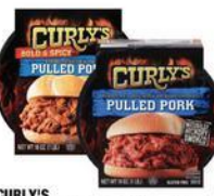
CURLY'S PULLED PORK 16 oz. original or bold & spicy