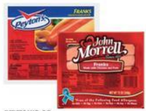
PEYTON'S OR JOHN MORRELL MEAT FRANKS 12 oz.