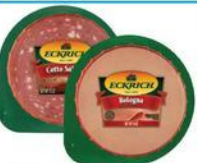
ECKRICH BOLOGNA OR COTTO SALAMI 12-16 oz.