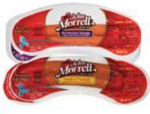
JOHN MORRELL SMOKED SAUSAGE 7 oz. regular, hot or polish