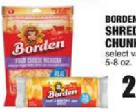
BORDEN SHREDDED OR CHUNK CHEESE select varieties 5-8 oz.