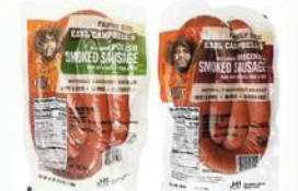
EARL CAMPBELL'S SMOKED SAUSAGE 40 oz. original or polish