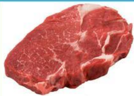
BEEF CHUCK STEAK preferred trim boneless family pack single pack $7.29 lb.