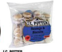
J.C. POTTER SAUSAGE BISCUITS 24 pack