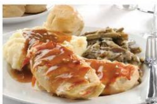
STAGE DOOR DELI 2 PIECE ROASTED CHICKEN MEAL w/ 2 Sides & a Roll

One of Lincoln's first in-store delis, Leon's provides only the finest Boar's Head meats and cheeses, along with delicious ready-to-eat items from our hot case.