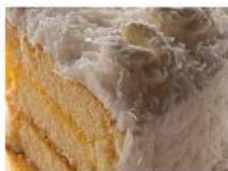
STAGE DOOR DELI COCONUT ORANGE CAKE SLICE