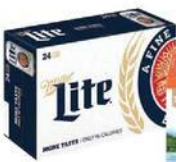
24 PACK MILLER LITE 12 oz. Cans