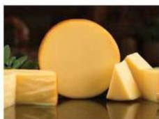
BOAR'S HEAD SMOKED GOUDA