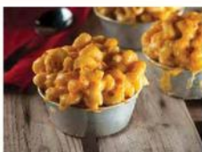
STAGE DOOR DELI CRAB MAC & CHEESE 16 oz.