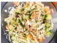
STAGE DOOR DELI MEDITERRANEAN COLESLAW