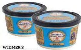
WIDMER'S CHEESE CELLARS BRICK CHEESE SPREAD 8 oz.