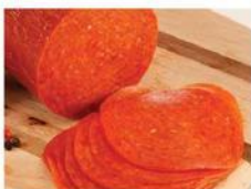
BOAR'S HEAD PEPPERONI