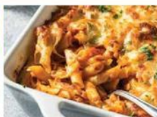
STAGE DOOR DELI BAKED MOSTACCIOLI