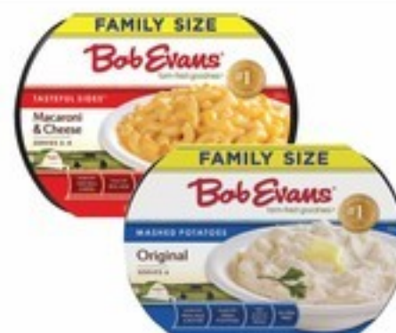
Bob Evans Family Size Side Dishes Selected Varieties 28-32 Oz.