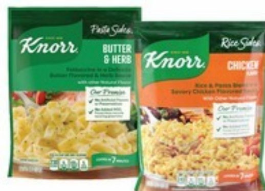
4-5.8 Oz. Selected Varieties Knorr Pasta or Rice Sides