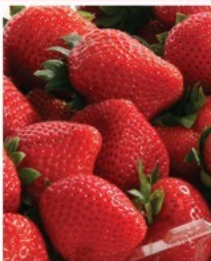
1 Lb. Fresh Strawberries