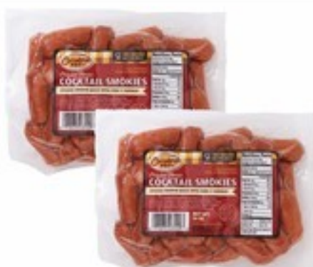
Carolina Pride Cocktail Smokies Selected Varieties 14 Oz.