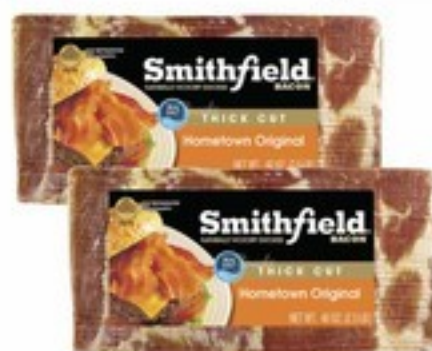
40 Oz. Smithfield Hometown Bacon