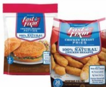
Fast Fixin' Breaded Chicken Strips, Nuggets or Patties Selected Varieties 22-24 Oz.