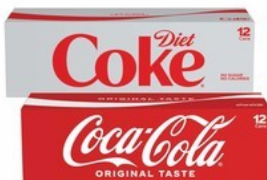
12 Pk./12 Oz. Cans Selected Varieties Coca-Cola Products