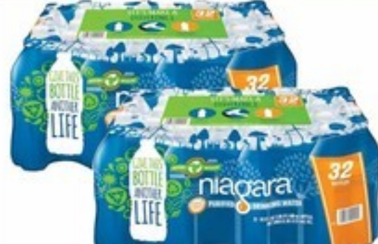
32 Pk. Niagara Water