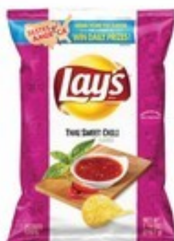
4.75-8 Oz. Selected Varieties Frito-Lay XL Lay's