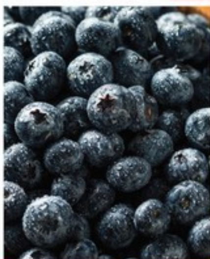
Pint Fresh Blueberries