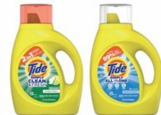
31-32 Oz. Selected Varieties Tide Liquid Simply Laundry Detergent