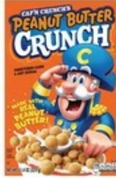
10.3-14.5 Oz. Cap'n Crunch, Life or Oat Squares Quaker Cereal