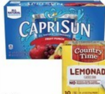
10 Ct. Selected Varieties Capri Sun or Country Time Lemonade