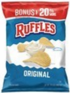
5.5-10.25 Oz. Selected Varieties Frito-Lay Ruffles