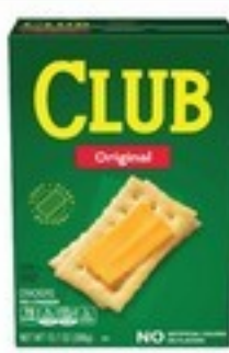
9-15 Oz. Selected Varieties Town House, Club or Keebler Grahams