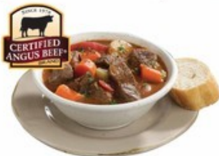
Certified Angus Beef® Boneless Stew Meat