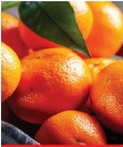
3 Lb. Bag Halos Mandarins