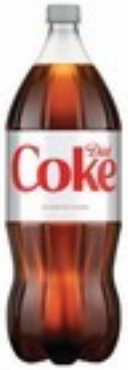
2 Liter Bottles Selected Varieties Coca-Cola Products