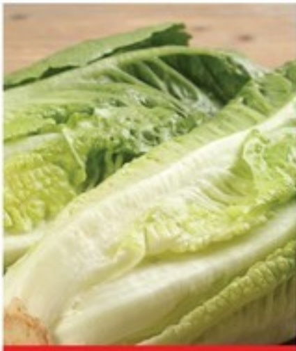
3 Ct. Romaine Hearts