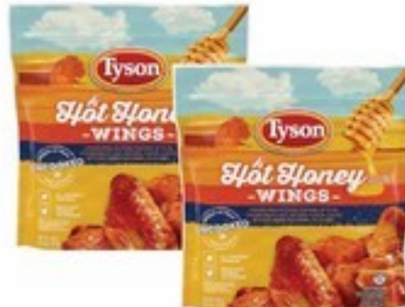
Tyson IQF Hot Honey Wings Selected Varieties 40 Oz.