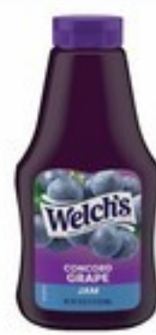
20 Oz. Selected Varieties Welch's Grape Jelly