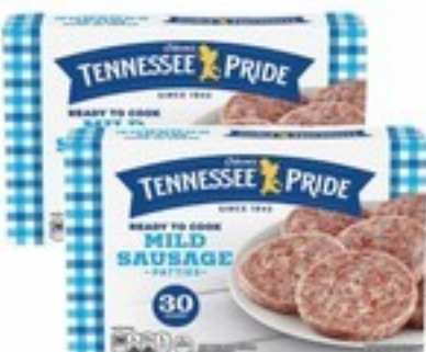
Tennessee Pride Pork Sausage Patties Selected Varieties 40 Oz.