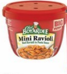
7.5-15 Oz. Selected Varieties Chef Boyardee Microwave Cups or Pasta