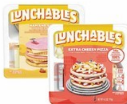
Oscar Mayer Lunchables Selected Varieties 2.25-4.4 Oz.