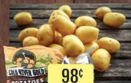
3 lb. Bag Cold River Gold Potatoes