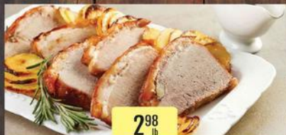
Fresh Pork Tenderloin