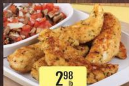
Family Pack Chicken Tenders