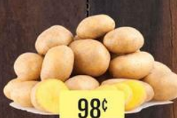
3 lb. Bag Country Roots Yellow Potatoes