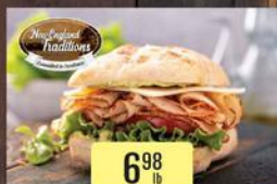
Deli Sliced - Selected Variety New England Traditions Turkey Breast