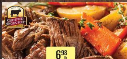
Certified Angus Beef® Boneless Chuck Pot Roast