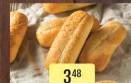
6 Pack Selected Variety Grinder Rolls