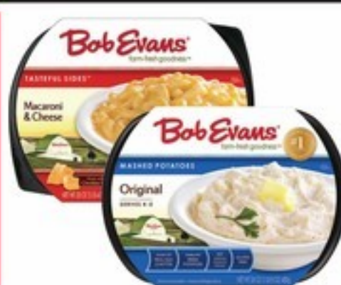
Bob Evans Side Dishes Selected Varieties 12-24 Oz.