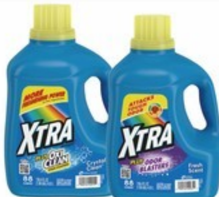
129.2-136.4 Oz. Selected Varieties Xtra Laundry Detergent