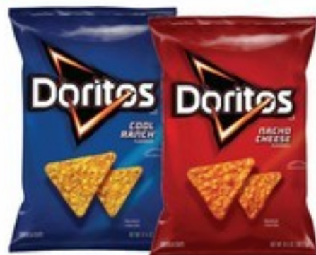
6-10.75 Oz. Selected Varieties Frito-Lay Doritos