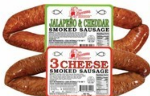
Butcher Shoppe Smoked Sausage Selected Varieties 14 Oz.