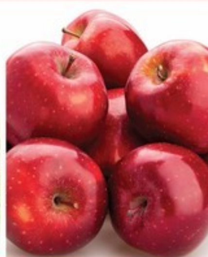
Washington Red Delicious Apples