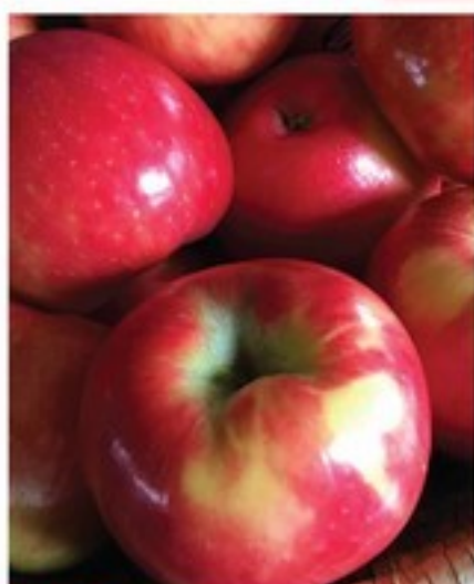
3 Lb. Bag Michigan Honeycrisp Apples