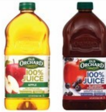
64 Oz. Selected Varieties Old Orchard Juice