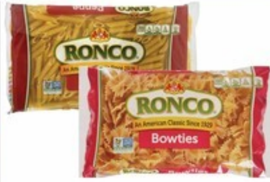
12 Oz. Selected Varieties Ronco Pasta