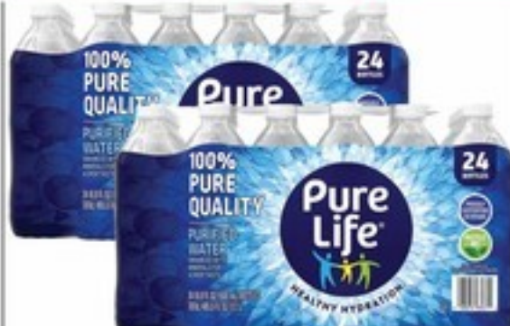
24 Pk./16.9 Oz. Btl. Pure Life Water