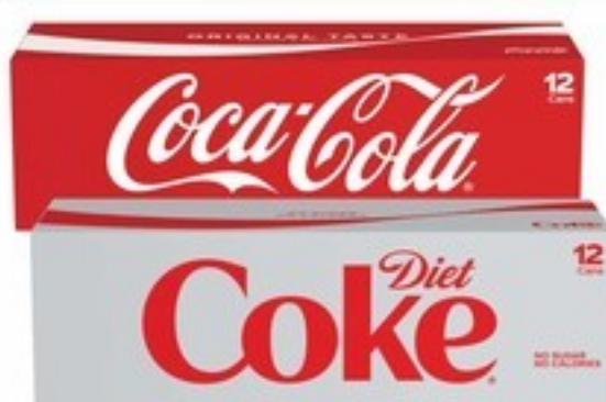
12 Pk./12 Oz. Cans Selected Varieties Coca Cola Products