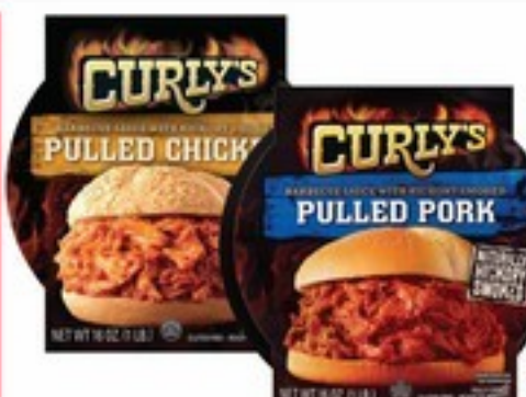
Curly's BBQ Pulled Meats Selected Varieties 15-16 Oz.