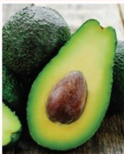
Ripened and Green Avocados