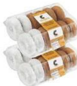
Clyde's Variety Donuts 12 Ct.