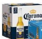
12 PACK CORONA OR MODELO 12 oz. Bottles or Cans