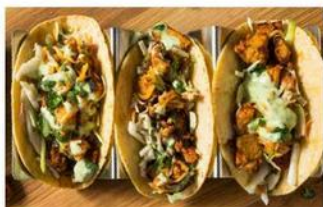
STAGE DOOR DELI CHICKEN STREET TACOS 3 Ct.

One of Lincoln's first in-store delis, Leon's provides only the finest Boar's Head meats and cheeses, along with delicious ready-to-eat items from our hot case.