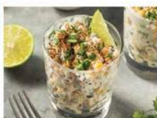
STAGE DOOR DELI MEXICAN STREET CORN SALAD