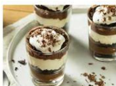
STAGE DOOR DELI MEXICAN CHOCOLATE PARFAIT