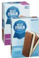
Blue Ribbon Classics Novelties 8 - 20 Ct.