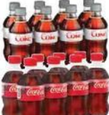
8 Pack Coke Products 12 oz. Bottles