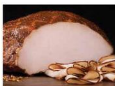
BOAR'S HEAD PITCRAFT SMOKED TURKEY