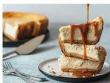
STAGE DOOR DELI CHURRO CHEESECAKE Slice