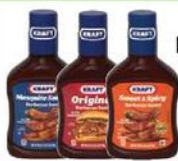
Kraft BBQ Sauce 17.5 - 18 oz.