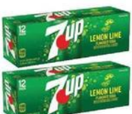
12 Pack 7UP Products 12 oz. Cans