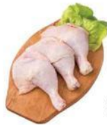
Frozen Chicken Leg Quarters 10 Lb. Bag