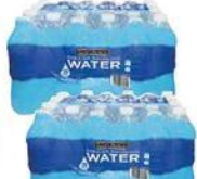
Best Choice Filtered Water .24 Pk. - 5 Liter Bottles