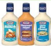
Kraft Dressing 14 - 16 oz.