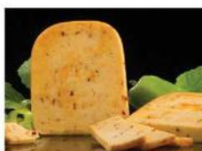
BOAR'S HEAD CHIPOTLE GOUDA