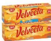
Velveeta Loaf 2 Lb.