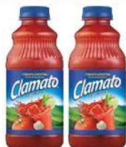
Clamato Tomato Juice Cocktail 32 oz.