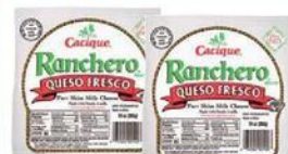
CACIQUE CHEESE Asst., 10 oz.