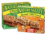
Nature Valley, General Mills, Fiber One, Mott's, or Chex Mix Bars, Biscuits, Brownies, Donuts, or Oatmeal or Granola Squares 4 - 8 Ct.