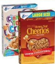
General Mills Cereal 12 - 16.8 oz.