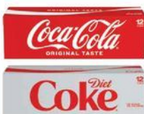
12 Pack Coke Products 12 oz. Cans