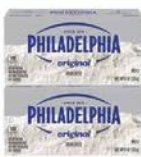
Philadelphia Cream Cheese 8 oz.