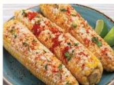
STAGE DOOR DELI ELOTES MEXICAN CORN ON THE COB