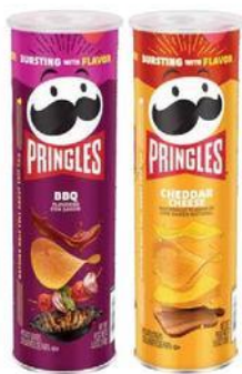
Pringles Potato Crisps 4.9 - 5.57 oz.