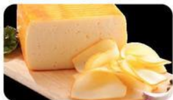
Kretschmar Muenster, Provolone or Mild Cheddar Cheese Sliced Fresh in our Deli