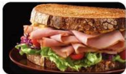
Kretschmar Ham off the Bone Deli Fresh, Selected Varieties