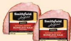
Smithfield Anytime Favorite Boneless Hams 1.5 lb pkg, Selected Varieties