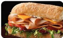
Kretschmar Seasoned Turkey Breast Deli Fresh, Selected Varieties