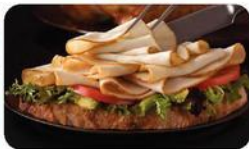
Kretschmar Turkey off the Bone Deli Fresh