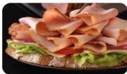
Kretschmar Honey or Virginia Ham Deli Fresh