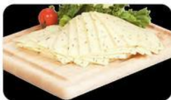
Kretschmar Colby, Colby Jack or Pepper Jack Cheese Sliced Fresh in our Deli