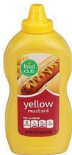
FOOD CLUB MUSTARD 20 oz. squeeze bottle