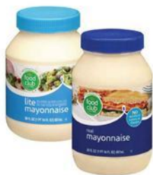
FOOD CLUB MAYONNAISE 30 oz. real or lite