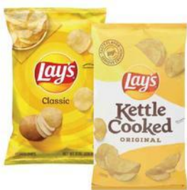
LAY'S CLASSIC OR KETTLE COOKED select varieties 5-8 oz.