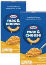
KRAFT MAC & CHEESE DINNER select varieties 7.25 oz.