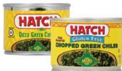
HATCH GREEN CHILE select varieties 4 oz.