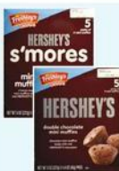
MRS. FRESHLEY'S MINI MUFFINS 5 pk. chocolate or s'mores