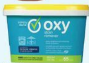
SIMPLY DONE OXY POWDER LAUNDRY DETERGENT 3 lb.