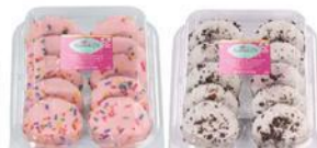
SWEET P'S CAKE COOKIES select varieties 7.7 oz.