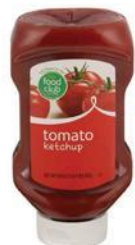
FOOD CLUB KETCHUP 20 oz. upside down squeeze bottle