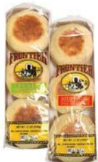
FRONTIER ENGLISH MUFFINS 12 oz. plain or sour dough