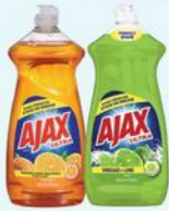
AJAX DISH WASHING SOAP select varieties 28 oz.