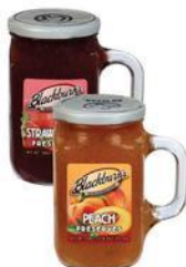
BLACKBURN'S PRESERVES select varieties 18 oz.