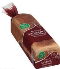
FOOD CLUB SANDWICH WHEAT BREAD 24 oz.