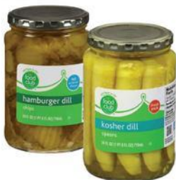
FOOD CLUB PICKLES select varieties 24 oz.