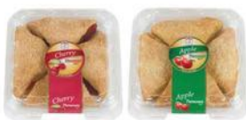
CAFE VALLEY TURNSOVERS select varieties 4 count