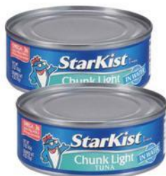
STARKIST CHUNK LIGHT TUNA 5 oz. in water