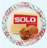
SOLO PAPER PLATES select varieties 22-48 ct.