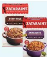
ZATARAIN'S RICE DINNER MIXES select varieties 8 oz.