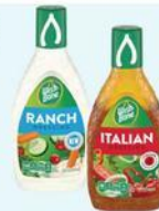
WISH-BONE SALAD DRESSING select varieties 15 oz.