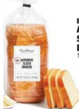
EURO CLASSIC AUTHENTIC SLICED BRIOCHE BREAD 17.64 oz.