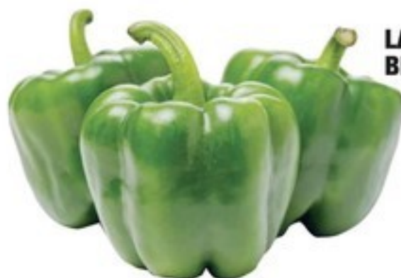
LARGE GREEN BELL PEPPERS