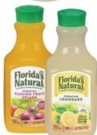
FLORIDA'S NATURAL FRUIT DRINK select varieties 59 oz.