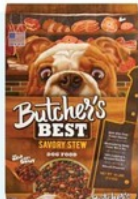
BUTCHER'S BEST DOG FOOD select varieties 16 lb.