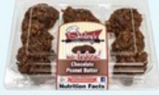
SHIRLEY'S COOKIE NO BAKE COOKIES 13.5 oz. chocolate or peanut butter