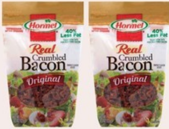
HORMEL REAL CRUMBLLED BACON 4.3 oz.