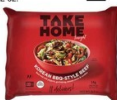
RANA TAKE HOME ASIAN DINNERS select varieties 21.8-22.5 oz.