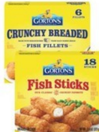
GORTON'S CRUNCHY FISH FILLET OR STICKS 11.4 oz.