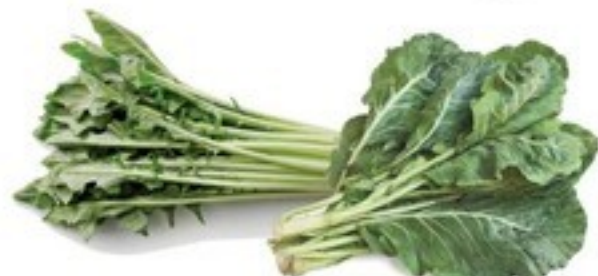
GREENS BUNCH collard, mustard or turnip