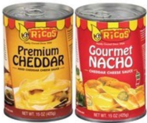
RICOS CHEDDAR CHEESE SAUCE select varieties 15 oz.