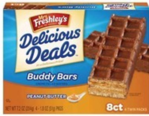
MRS. FRESHLEY'S BUDDY BARS 8 ct.