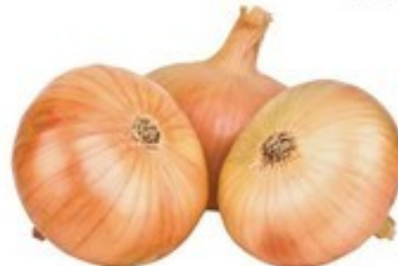
JUMBO SWEET YELLOW ONIONS