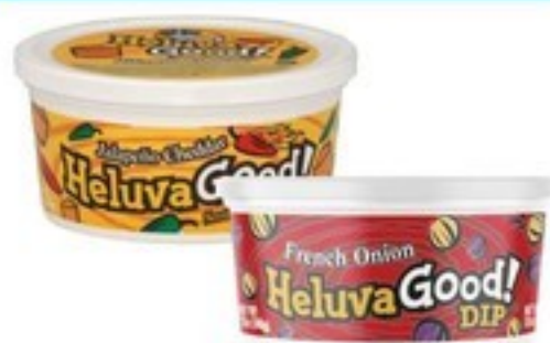
HELUVA GOOD! PARTY DIPS select varieties 12 oz.