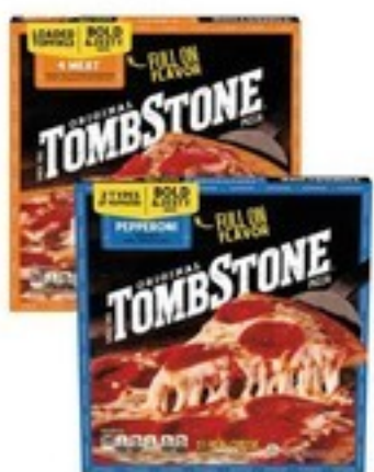
TOMBSTONE ORIGINAL PIZZA select varieties 18.5-20.2 oz.