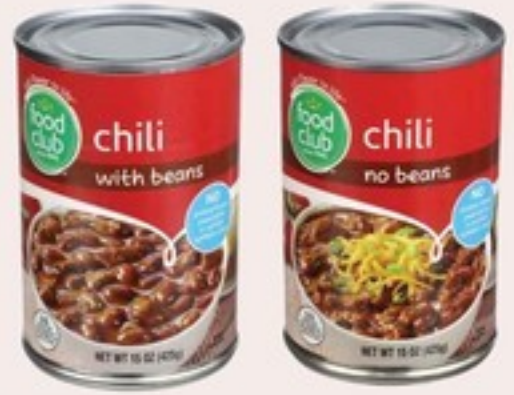
FOOD CLUB CHILI 15 oz. no beans or with beans