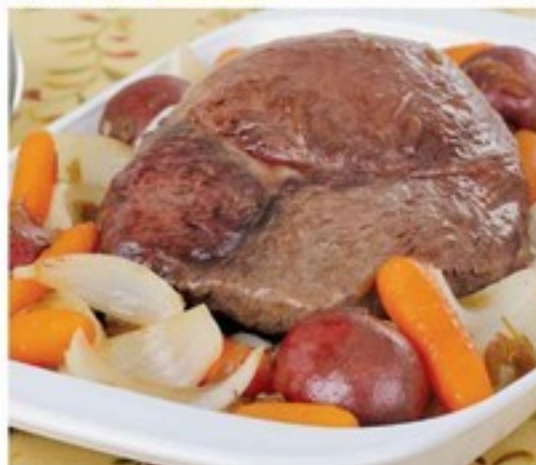
BEEF BOTTOM ROUND ROAST boneless family pack single pack $6.99 lb.