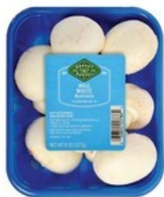
BASKET & BUSHEL WHITE MUSHROOMS 8 oz.