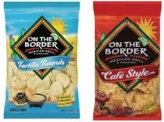
ON THE BORDER TORTILLA CHIPS 10.5-11 oz. café style or round