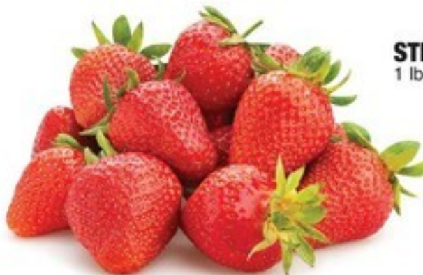
STRAWBERRIES 1 lb.