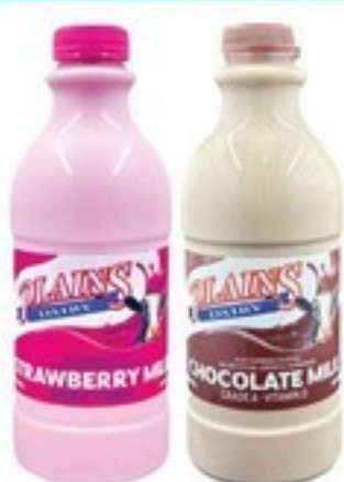
PLAINS DAIRY MILK 1 qt. chocolate or strawberry