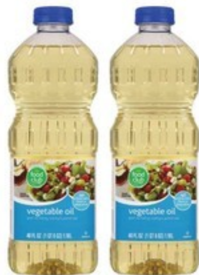
FOOD CLUB VEGETABLES OIL 40 oz.