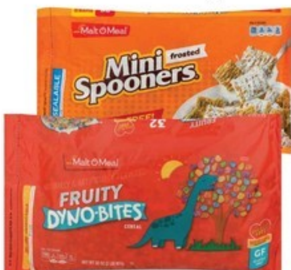
MALT O MEAL CEREAL select varieties 30-36 oz.