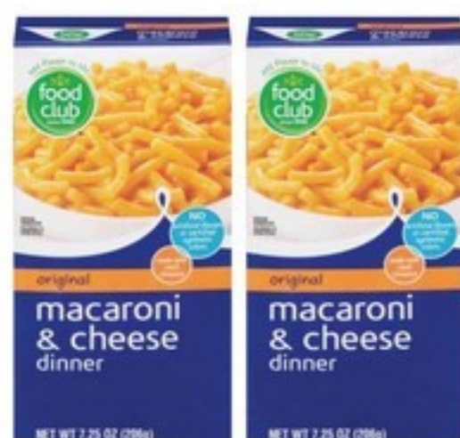
FOOD CLUB MACARONI & CHEESE DINER 7.25 oz.