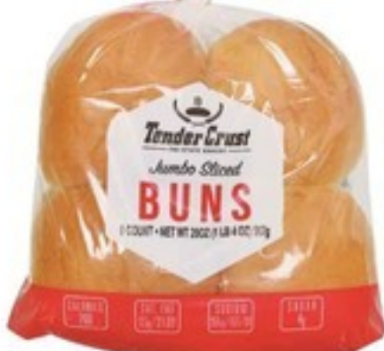
HAMBURGER BUNS 8 pk. 4.5 inch