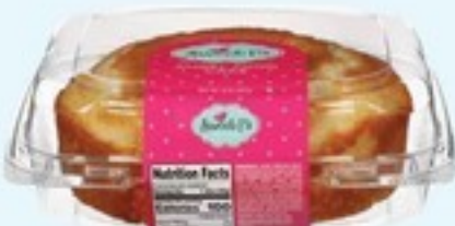
SWEET P'S ANGEL FOOD CAKE 8 oz.