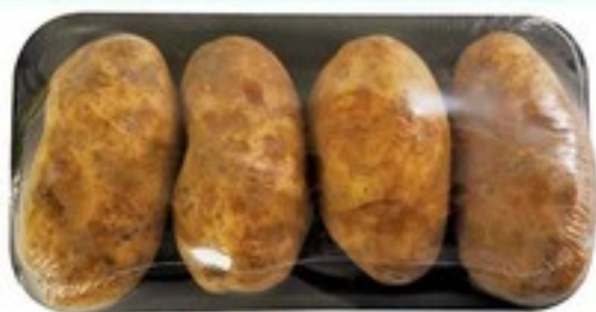
BAKE POTATOES 4 count cello pack