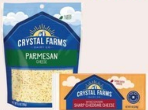
CRYSTAL FARMS SHREDDED OR CHUNK CHEESE select varieties 5.5-8 oz.