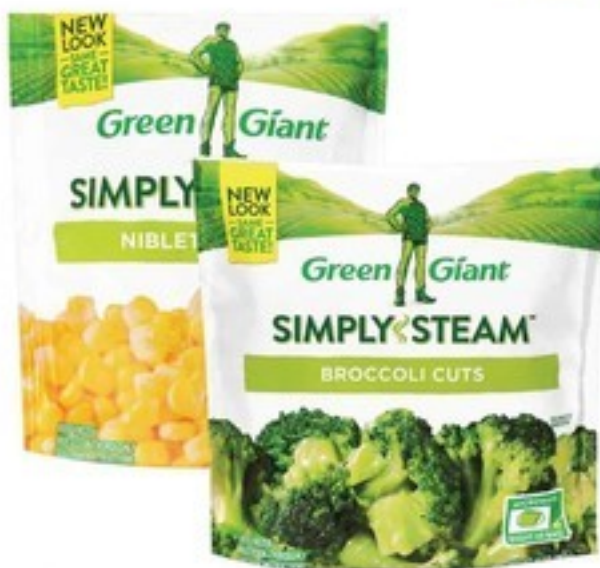
GREEN GIANT FROZEN VEGETABLES select varieties 8-10 oz.