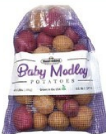
MOUNTAIN KING BABY POTATOES select varieties 1.5 lb. bag