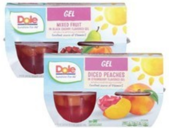
DOLE FRUIT CUPS select varieties 4 pack