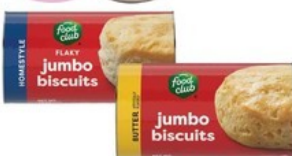
FOOD CLUB JUMBO BISCUITS select varieties 8 ct.