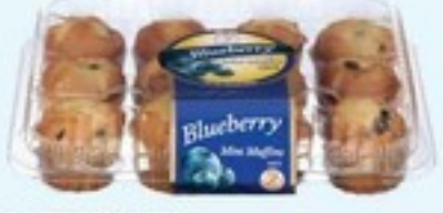
CAFE VALLEY MINI MUFFINS select varieties 12 ct.