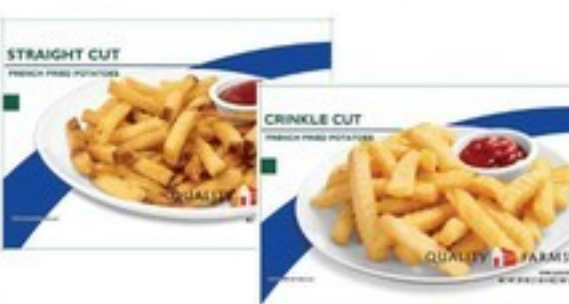
QUALITY FARMS FRENCH FRIES 20 oz. crinkle or straight cut