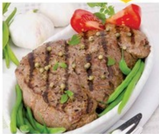
BEEF TOP SIRLOIN STEAK preferred trim boneless family pack single pack $6.99 lb.