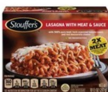
STUFFER'S DINNERS OR PIZZA select varieties 7.8-12.62 oz.