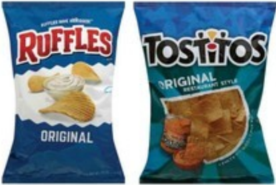
RUFFLES OR TOSTITOS select varieties preprice $5.99