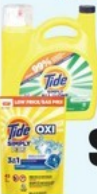
TIDE SIMPLY DETERGENT select varieties 105-117 oz. liquid or 43 count pods