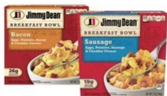
JIMMY DEAN BREAKFAST BOWLS select varieties 7-9 oz.