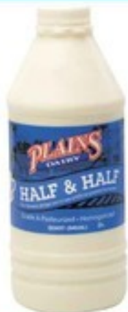
PLAINS DAIRY HALF HALF 32 oz.