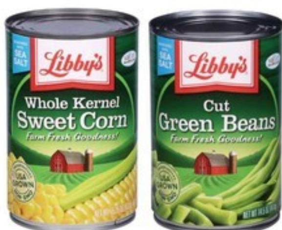
LIBBY'S CANNED VEGETABLES select varieties 11-15.2