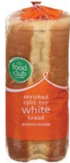
FOOD CLUB SPLIT TOP WHITE BREAD 24 oz.