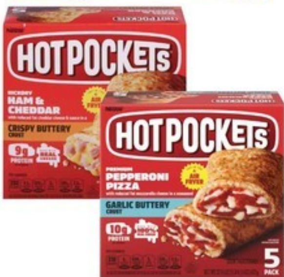
HOT POCKETS select varieties 5 pack