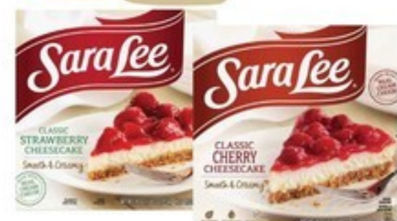
SARA LEE CHEESECAKE select varieties 17-19 oz.