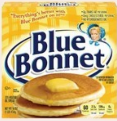
BLUE BONNET SPREAD QUARTERS 16 oz.