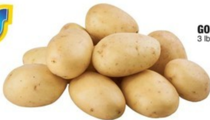
GOLD POTATOES 3 lb. bag