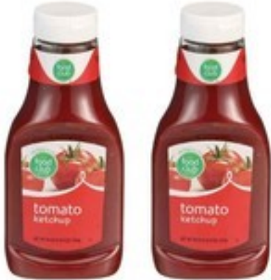
FOOD CLUB KETCHUP 38 oz. squeeze bottle