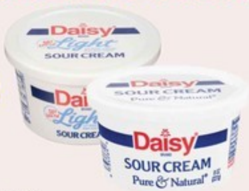
DAISY SOUR CREAM 8 oz. original or light