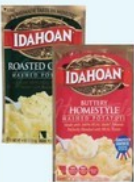
IDAHOAN POTATOES select varieties 4-4.1 oz.