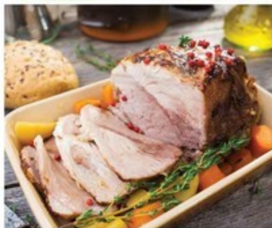
FRESH PORK ROAST "BOSTON BUTT" boneless