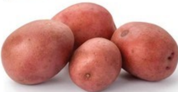
NEW RED POTATOES