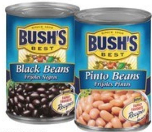
BUSH'S BEST BEANS select varieties 15-16 oz.