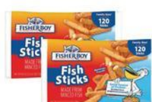
Fisher Boy Fish Sticks 120 ct.