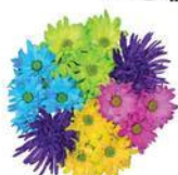
Splashy Craze Bouquet