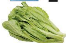
Fresh Greens collard, turnip, flat or curly leaf mustard