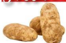
Baker Potatoes 4 ct.