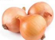
Sweet Yellow Onions jumbo