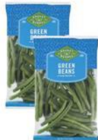
Basket & Bushel Green Beans 12 oz.