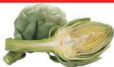
Artichokes fresh, desert grown