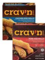
Cray'n Flavor Egg Rolls chicken or pork 12.2 oz.