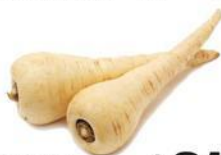
Parsnips great for soups & stews