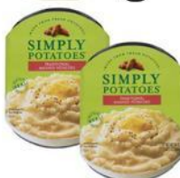
Simply Potatoes Mashed Potatoes 24 oz.