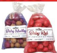
Mountain King Baby Potatoes Select Varieties 1.5 lb. bag