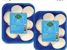
Basket & Bushel Whole White Mushrooms 8 oz.