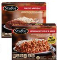
Stouffer's Dinners Select Varieties 7.8-12.62 oz.