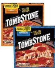
Tombstone Pizza Select Varieties 18.5-20.2 oz.