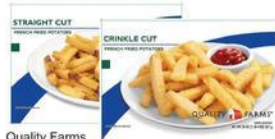
Quality Farms French Fried Potatoes crinkle or straight cut 20 oz.