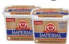
Imperial Spread 45 oz.