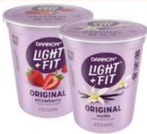
Dannon Light + Fit Yogurt vanilla or strawberry 32 oz.