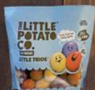
1.5 lb. Pkg. Selected Variety The Little Potato Co. Potatoes