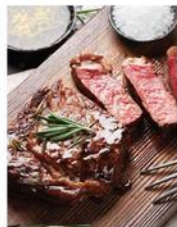
USDA Select Beef Boneless Ribeye Steak $12 99 lb