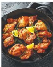
Fresh Family Pack Boneless Skinless Chicken Thighs $2 49 lb