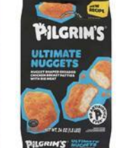
24 oz. Pkg. Selected Variety Pilgrim's Chicken Nuggets $6 99