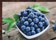
Pint Fresh Blueberries