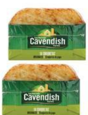
21.16 oz. Pkg. Cavendish Farms Potato Patties $3 49