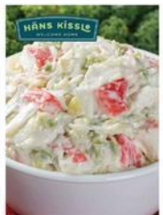
In the Deli Häns Kissle Seafood Salad $7 99 lb