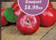
Washington State Premium Cosmic Crisp or Fuji Apples