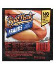
15 oz. Pkg. Ball Park Franks $2 99