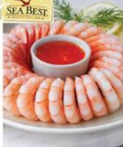
Frozen-10 oz. Pkg. Sea Best Shrimp Ring $6 99