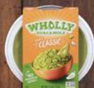
7.5 oz. Pkg. Selected Variety Wholly Guacamole