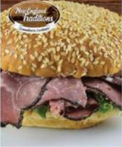
Deli Sliced New England Traditions Pastrami or Corned Beef $12 99 lb