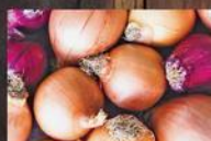
Imported Sweet Onions