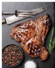
USDA Select Beef T-Bone Steak $9 99 lb

WE PROUDLY SELL BEEF, PORK AND CHICKEN FROM THE USA!!!