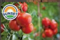
Fresh Sunset Cluster Tomatoes