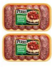
16 oz. Pkg. Hot or Sweet Perri Italian Sausage $4 49