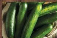
Florida Fresh Cucumbers