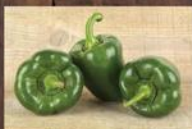
Florida Green Peppers