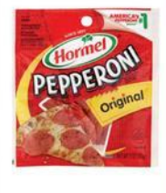
5-6 oz. Pkg. Selected Variety Hormel Pepperoni $3 99