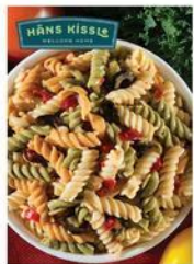
Delicious Häns Kissle Twist Pasta Salad $3 99 lb