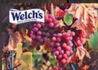
Fresh Welch's Red Grapes