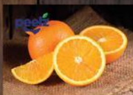
8 lb. Bag-California Peel Navel Oranges