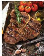
USDA Select Beef Porterhouse Steak $10 99 lb