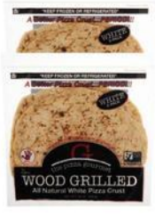
19 oz. Pkg. Selected Variety The Pizza Gourmet Pizza Crust $5 99