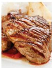
Fresh Boneless Pork Sirloin Cutlets $2 49 lb