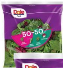
Dole Salad Blends Select Varieties 5-9 oz.