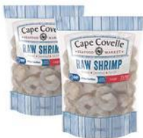
Raw Shrimp Select Varieties peeled & deveined 31/40 ct., 1 lb.