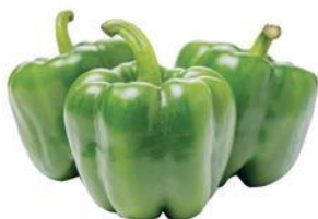
Green Bell Peppers Large