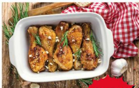
Drumsticks or Thighs Family Pack