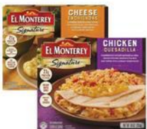
El Monterey Dinners Select Varieties 10 oz.