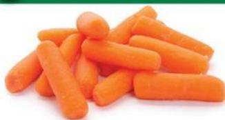
Mini Peeled Baby Carrots 1 lb.