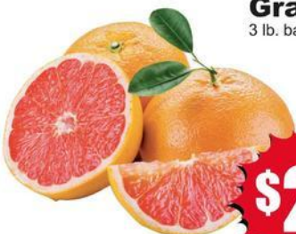
Grapefruit 3 lb. bag