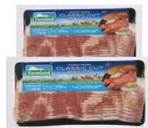
Farmland Hickory Smoked Sliced Bacon 12 oz.