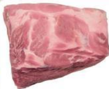
Pork Shoulder Roast Fresh