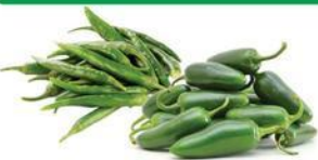
JALAPENO OR SERRANO PEPPERS spicy