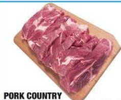
PORK COUNTRY STYLE RIBS OR STEAK