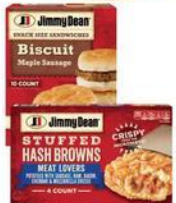
JIMMY DEAN BREAKFAST SNACKS select varieties 12.8-17 oz.