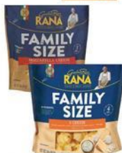
RANA TORTELLINI OR RAVOLLI select varieties 20 oz. family size