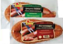
EDDY SMOKED SAUSAGE 14 oz. old fashioned or jalapeno cheddar