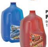
PLAINS PUNCH select varieties 128 oz.