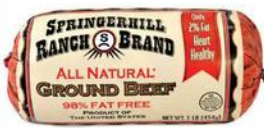
SPRINGERHILL RANCH BRAND ALL NATURAL GROUND BEEF 1 lb. roll all natural 98% lean