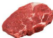
BEEF CHUCK STEAK preferred trim boneless