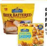
GORTON'S FISH STICKS, FILLETS OR POPCORN SHRIMP select varieties 18.2-19 oz.