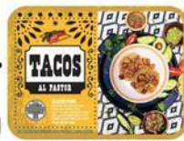
FRESH CUTS TACOS AL PASTOR