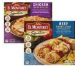
EL MONTEREY DINNERS select varieties 10 oz.