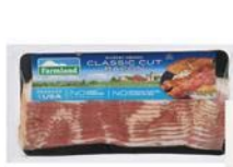
FARMLAND SLICED BACON 12 oz.