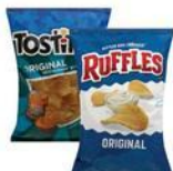
RUFFLES OR TOSTITOS select varieties preprice $5.99 5.5-13 oz.