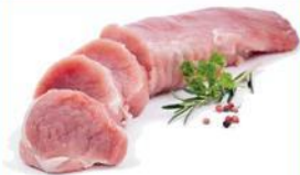
PORK TENDERLOIN boneless