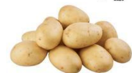
GOLD POTATOES 3 lb. bag