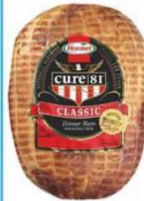
BONELESS HAM whole, half or sliced half