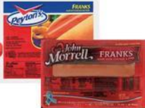
PEYTON'S OR JOHN MORRELL MEAT FRANKS 12 oz.