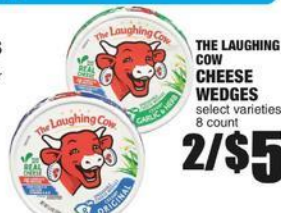
THE LAUGHING COW CHEESE WEDGES select varieties 8 count