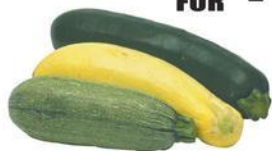
SQUASH yellow, mexican or zucchini