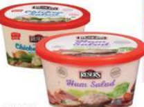
RESER'S DELI MEAT SALAD select varieties 12 oz.