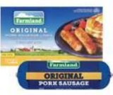
FARMLAND SAUSAGE 8 oz. links or 12 oz. roll