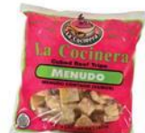
LA COCINERA BEEF CUBE TRIPE 4 lb. bag