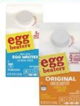
EGG BEATERS 15-16 oz. original, whites or southwest