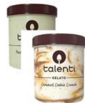
TALENTI GELATO select varieties pt.