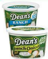
DEAN'S PARTY DIPS select varieties 16 oz.