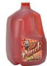
PLAINS PUNCH select varieties 128 oz.