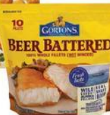
GORTON'S FISH STICKS, FILLETS OR POPCORN SHRIMP select varieties 18.2-19 oz.