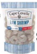
CAPE COVELLE RAW SHRIMP 1 lb. 31/40 p&d