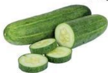
LARGE GREEN CUCUMBERS