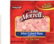
JOHN MORRELL MINI CUBED HAM 8 oz. "great for salads"