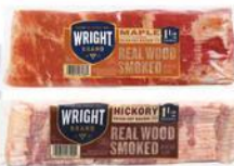
WRIGHT STACK PACK BACON select varieties 1.5 lb.