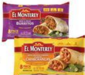
EL MONTEREY CHIMICHAGAS OR BURRITOS select varieties 32 oz.