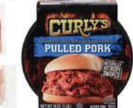
CURLY'S PULLED PORK select varieties 16 oz.