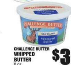
CHALLENGE BUTTER WHIPPED BUTTER 8 oz.