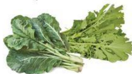
BUNCH GREENS collard mustard or tunip