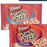
TOTINO'S PARTY PIZZAS select varieties 9.8-10.9 oz.