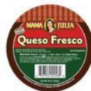
MAMA JULIA CHEESES queso fresco, grated cotija, shredded quesadilla or asadero