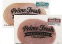
PRIME FRESH LUNCH MEAT select varieties 7-8 oz.