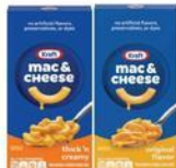
KRAFT MAC & CHEESE DINNER 7.25 oz. original or thick 'n creamy