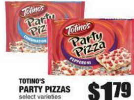
TOTINO'S PARTY PIZZAS select varieties 9.8-10.9 oz.