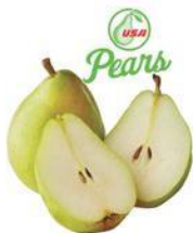
LARGE GREEN PEARS