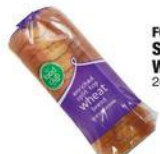
FOOD CLUB SPLIT TOP WHEAT BREAD 24 oz.