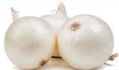
JUMBO WHITE ONIONS