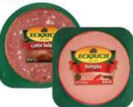
ECKRICH BOLOGNA OR SALAMI 12-14 oz.