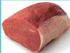
BEEF EYE OF ROUND STEAK OR ROAST preferred trim boneless