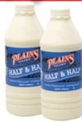
Plains Half & Half 32 oz.