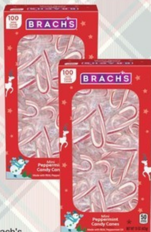
Brach's Mini Peppermint Candy Canes 100 ct.