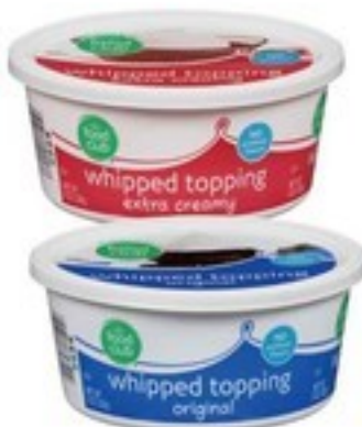
Food Club Whipped Topping Select Varieties 8 oz.