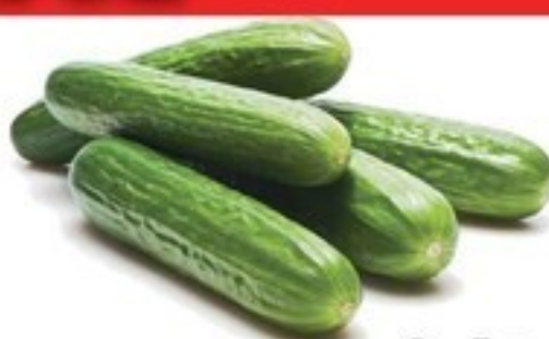
Super Select Cucumbers