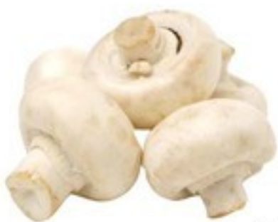
White Mushrooms 8 oz.