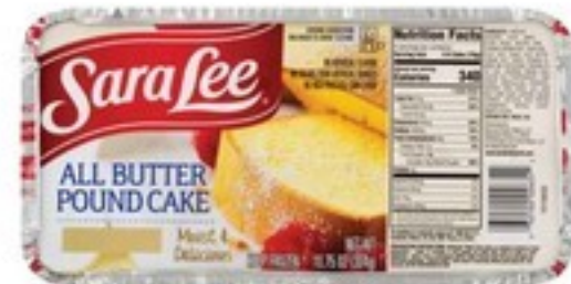
Sara Lee Pound Cake 10.7 oz.