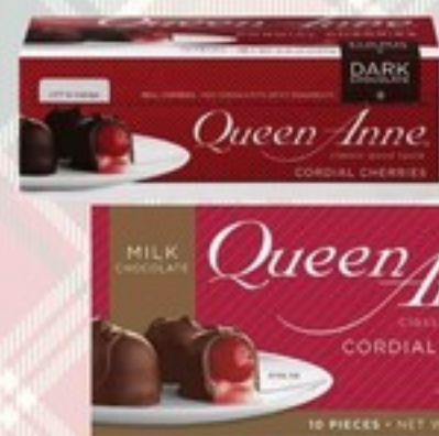
Queen Anne Cherry Cordials Select Varieties 6.6 oz.