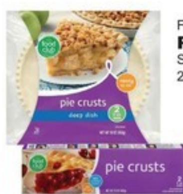
Food Club Pie Crusts Select Varieties 2 ct.