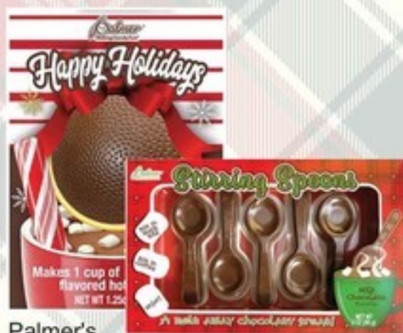
Palmer's Stirring Spoons or Hot Chocolate Bombs Select Varieties 1.25-3 oz.