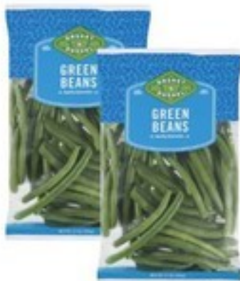
Basket & Bushel Green Beans 12 oz.