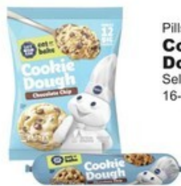
Pillsbury Cookie Dough Select Varieties 16-16.5 oz.