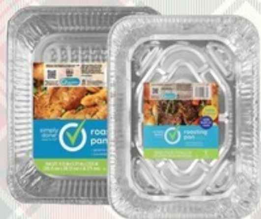
Simply Done Foil Pans Select Varieties 1-3 ct.