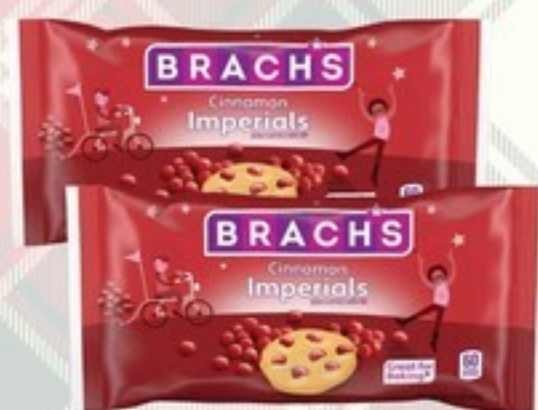
Brach's Cinnamon Imperials 12 oz.