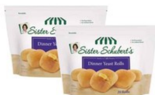
Sister Schubert's Dinner Yeast Rolls 20 ct.