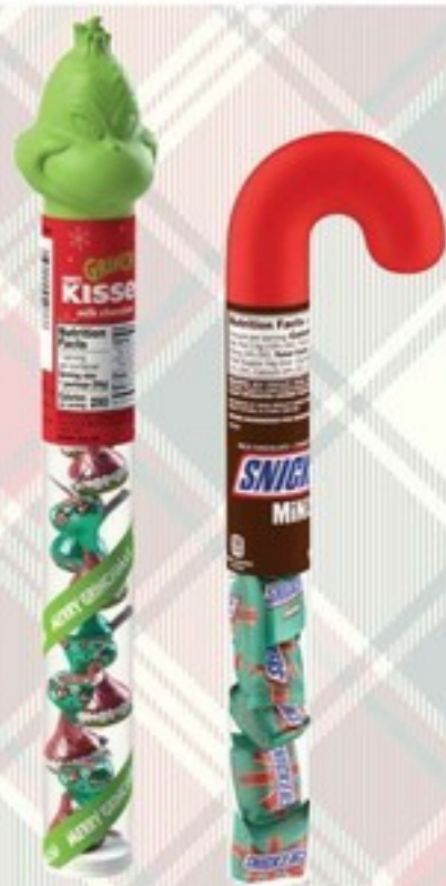
Mars Candy Filled Candy Canes Select Varieties 1.74-3 oz.