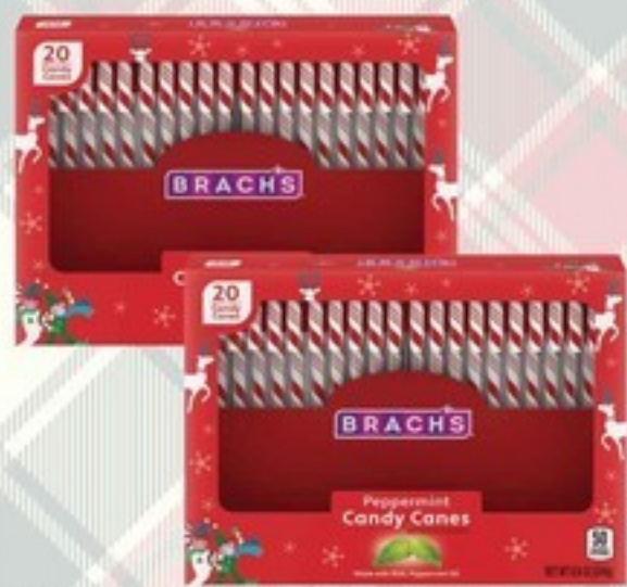
Brach's Peppermint Candy Canes 20 ct.