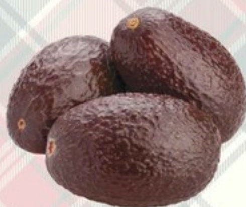
Hass Avocados Ripe