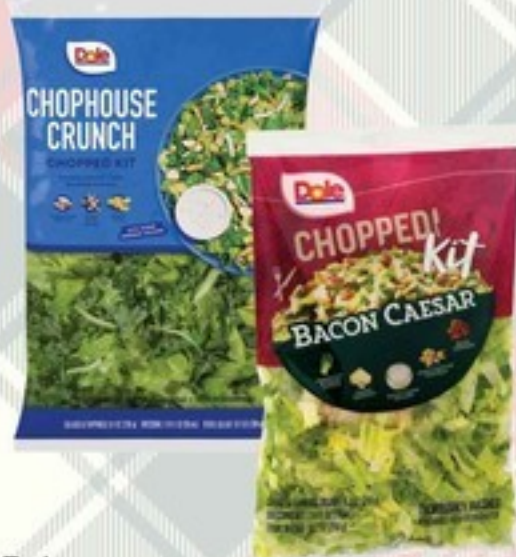
Dole Chopped Kits Select Varieties 10-12.2 oz.