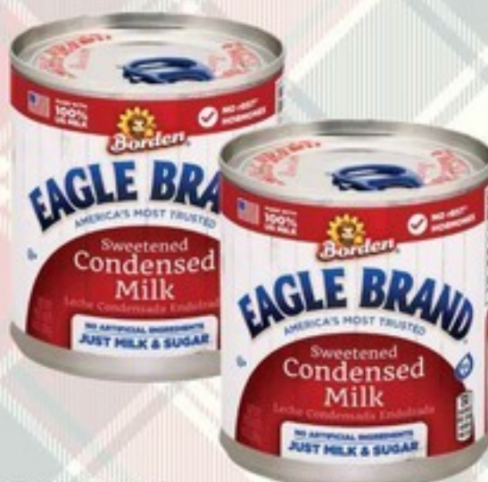
Eagle Brand Sweetened Condensed Milk 14 oz.