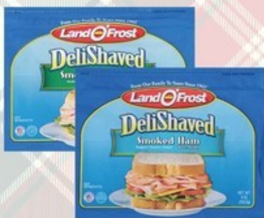
Land O'Frost Deli Shaved Lunch Meat Select Varieties 9 oz.