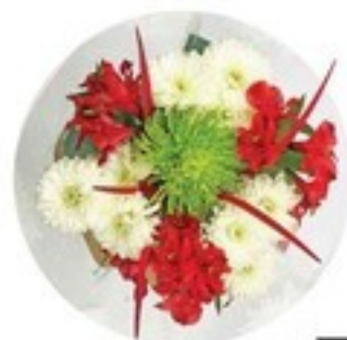
Dear Santa Bouquet