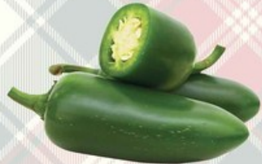
Jalapeño Peppers Spicy