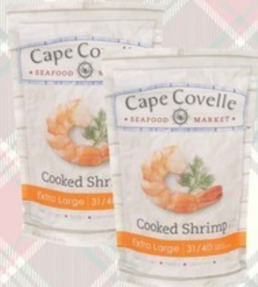
Cape Covelles Cooked Shrimp 31/40 ct., p&d, tail-on 1 lb. bag