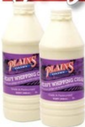
Plains Heavy Whipping Cream 32 oz.