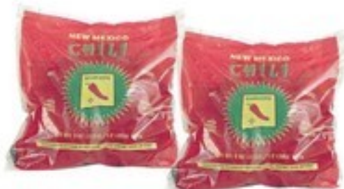
Barker's Chili Pods Select Varieties 8 oz.