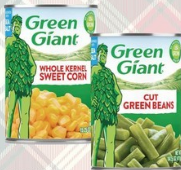
Green Giant Green Beans, Corn or Peas Select Varieties 14.5-15.25 oz.