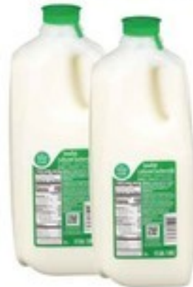
Food Club Buttermilk half gallon