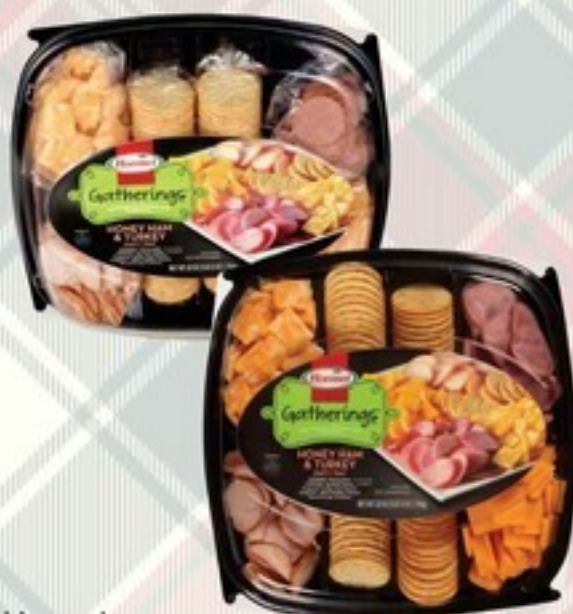
Hormel Party Trays Select Varieties 28 oz.