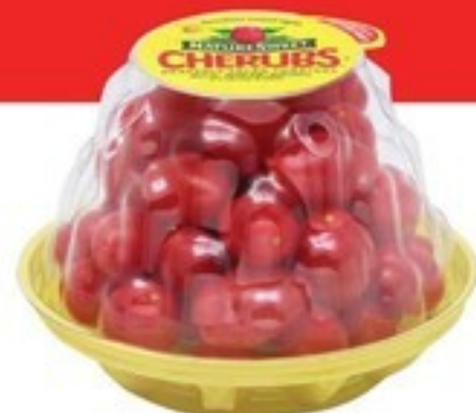
Nature Sweet Cherubs 10 oz.