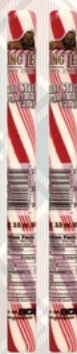
King Leo Giant Peppermint Stick 3.5 oz.