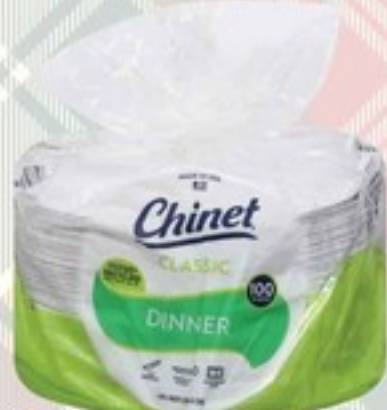
Chinet Classic Dinner Plates 100 ct.