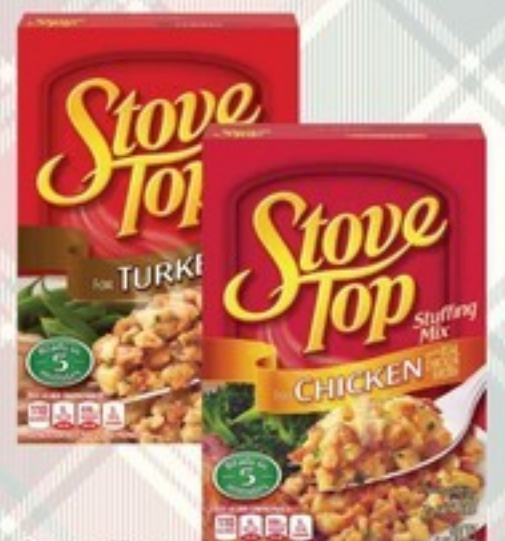
Stove Top Stuffing Mix Select Varieties 6 oz.