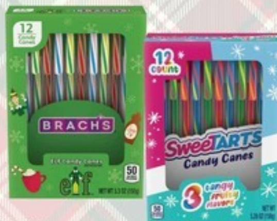
Brach's Holiday Candy Canes Select Varieties 12 ct.