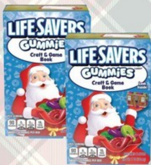
Candy Books Select Varieties 6.51-7 oz.