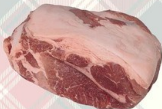
"Boston Butt" Pork Shoulders packer trim, 2 pc., previously frozen