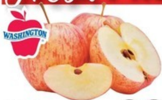
Apples Sugar Bee, large gala or granny smith