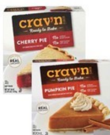
Crav'n Flavor Fruit Pies Select Varieties 36-38 oz.