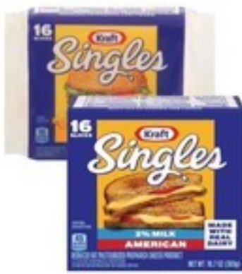
Kraft Singles Select Varieties 16 slices