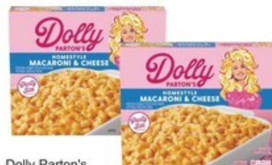
Dolly Parton's Homestyle Macaroni & Cheese 76 oz.