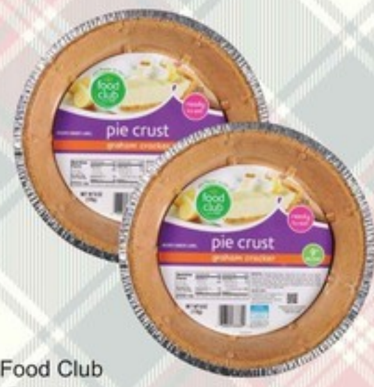
Food Club Graham Cracker Pie Crust Select Varieties 6 oz.