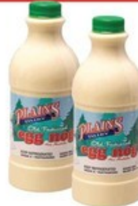
Plains Egg Nog quart