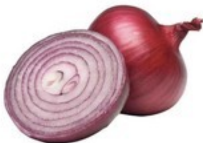
Italian Sweet Red Onions jumbo