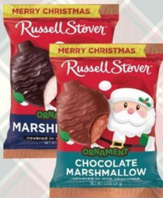
Russell Stover Chocolate Covered Ornaments Select Varieties 1.3 oz.