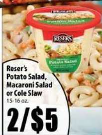
Reser's Potatko Salad, Macaroni Salad or Cole Slaw 15-16 oz.