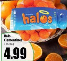
Halo Clementines 3 lb. bag