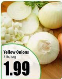
Yellow Onions 3 lb. bag