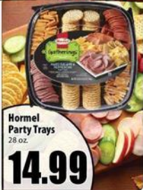
Hormel Party Trays 28 oz.