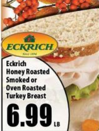
Eckrich Honey Roasted Smoked or Oven Roasted Turkey Breast