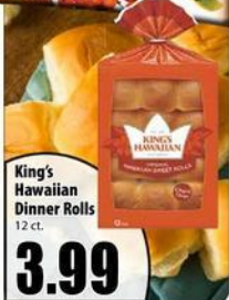
King's Hawaiian Dinner Rolls 12 ct.