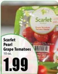
Scarlet Pearl Grape Tomatoes 10 oz.