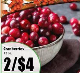
Cranberries 12 oz.