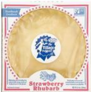
The Village Pie Maker Pies 30-40 Oz.

Prices Effective Wednesday Through Monday November 13 - December 2, 2024