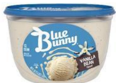
Blue Bunny Frozen Dairy Dessert 46-48 Oz.