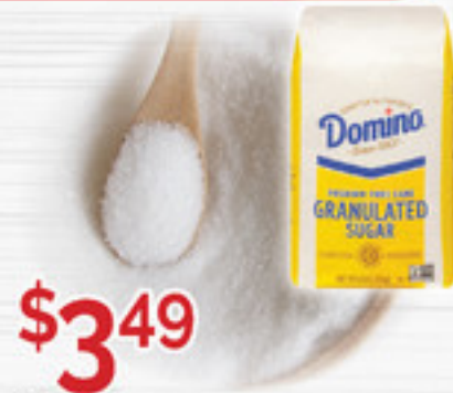
$3.49 4 lb. Domino Pure Cane Sugar