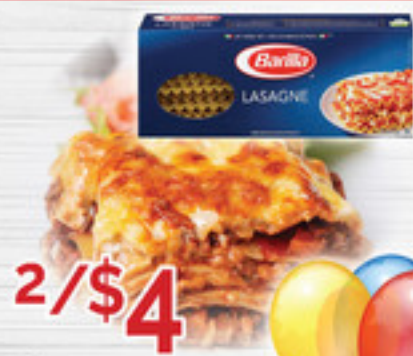
2/$4 16 oz. Barilla Lasagne Noodles