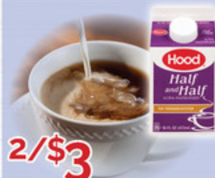
2/$3 16 oz. Hood Half & Half Creamer