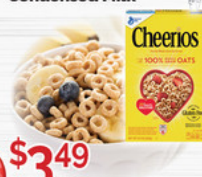
$3.49 8.9-12 oz. Selected Variety General Mills Cereal