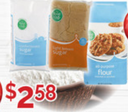
$2.58 2-5 lb. Bag, Selected Variety Food Club Flour or Baking Sugars