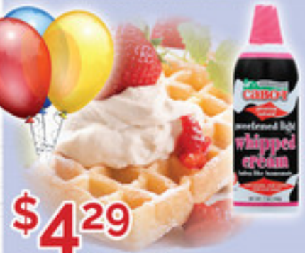
$4.29 14 oz. Light, Instant Cabot Whipped Cream