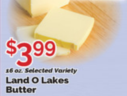
$3.99 16 oz. Selected Variety Land O Lakes Butter