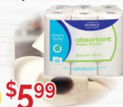
$5.99 6 Roll Pack, Simple Size Select Simply Done Paper Towels