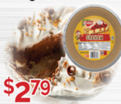
$2.79 4-6 oz. Selected Variety Keebler Ready Pie Crusts