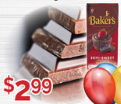
$2.99 4 oz. Selected Variety Baker's Baking Chocolate Bars