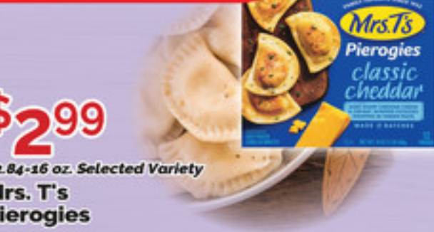
$2.99 12.84-16 oz. Selected Variety Mrs. T's Pierogies