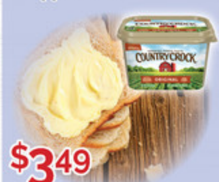
$3.49 14-15 oz. Selected Variety Country Crock Spreads