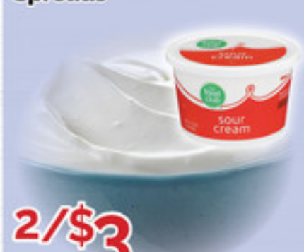
2/$3 16 oz. Selected Variety Food Club Sour Cream