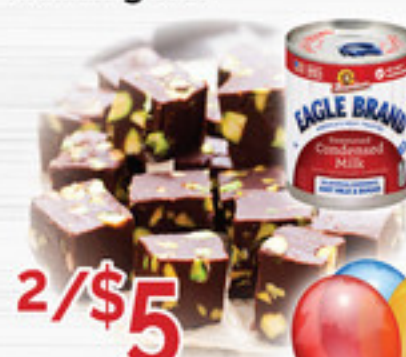
2/$5 14 oz. Sweetened Eagle Brand Condensed Milk