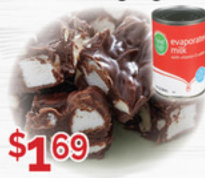
$1.69 12 oz. Food Club Evaporated Milk