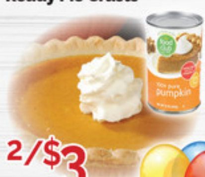
2/$3 15 oz. Food Club 100% Pure Pumpkin