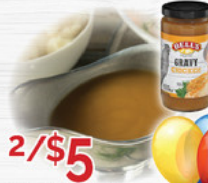
2/$5 12 oz. Selected Variety Bell's Jarred Gravy