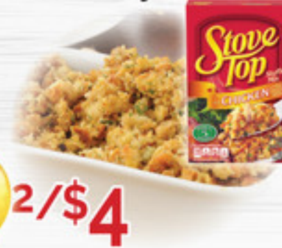
2/$4 6 oz. Selected Variety Stove Top Stuffing Mix