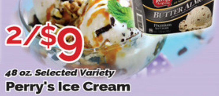
2/$9 48 oz. Selected Variety Perry's Ice Cream