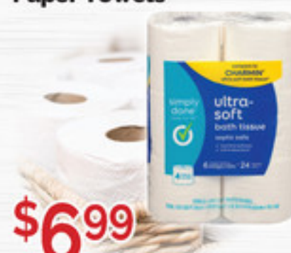
$6.99 6 Mega Rolls, Ultra Soft or Strong Simply Done Bathroom Tissue