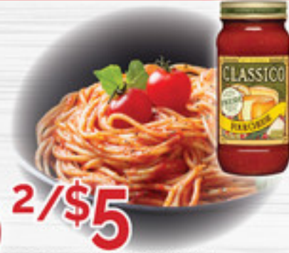
2/$5 15-24 oz. Selected Variety Classico Pasta Sauce