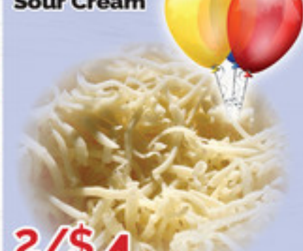
2/$4 8 oz. Selected Variety Dutch Farm Cheese Bars or Shreds