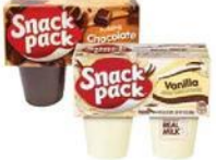
Snack Pack Pudding or Juicy Gels 4 Ct.