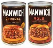
Manwich Sloppy Joe Mix 15 - 16 oz.