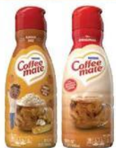
Coffee mate Creamer 32 oz.