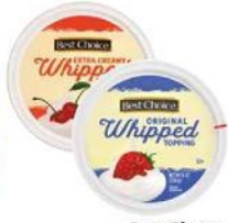
Best Choice Whipped Topping 8 oz.