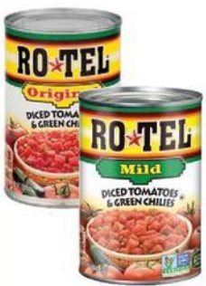
Ro-Tel Diced Tomatoes 10 oz.