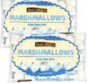
Best Choice Marshmallows 10 oz.