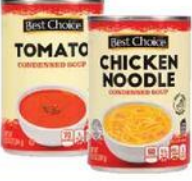
Best Choice Condensed Soup 10.5 - 11.25 oz.