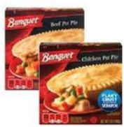
Banquet Pot Pies 7 oz.