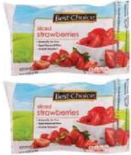
Best Choice Frozen Sliced Strawberries 15.5 oz. $1.98