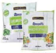
Best Choice Steamable Vegetables 12 oz.