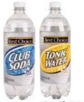
Best Choice Mixers 1 Liter Bottle