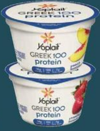
Yoplait Greek 100 Yogurt 5.3 oz.

From time-tested classics to exotic surprises, Leon's only offers our customers the finest frozen goods and sweet treats.