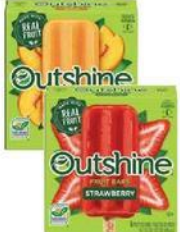
Outshine Fruit Bars 6 Ct. $2.98