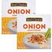
Best Choice Onion Soup Mix 2 oz.