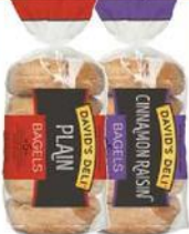
David's Deli Bagels 14.2 - 14.25 oz.