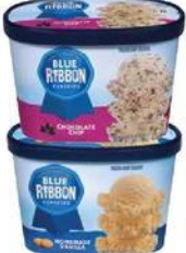
Blue Ribbon Classics Dairy Dessert 48 oz. $2.98