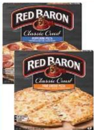
Red Baron Pizza 15.77 - 23.45 oz. 2/$7