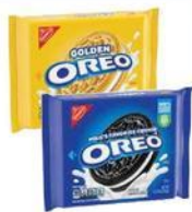
Nabisco Oreo Cookies 9.6 - 21 oz.