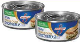
Swanson White Premium Chunk Chicken Breast 4.5 oz.