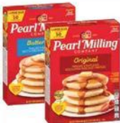
Pearl Milling Co. Pancake & Waffle Mix 32 oz.