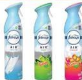
Febreze Air Freshener Spray 8.8 oz.