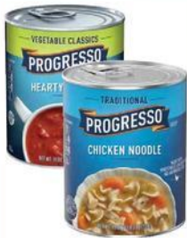
Progresso Soup 18 - 19 oz.

Our selection of top-quality groceries along with Lincoln's widest range of specialty items makes Leon's perfect for everyday shoppers and foodies alike.