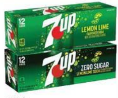
12 Pack 7UP Products 12 oz. Cans