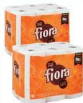
Fiora Paper Towels 6 Rolls