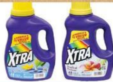
Xtra Laundry Detergent 56 - 57.6 oz.