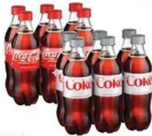
6 Pack Coca-Cola Products 500mL Bottles