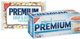
Nabisco Premium Saltines or Soup & Oyster 9 - 16 oz.