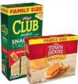
Kellogg's Family Size Town House or Club Crackers 18.8 - 20.7 oz.