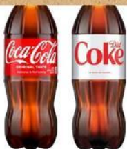
Coca-Cola Products 2 Liter Bottles