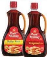
Pearl Milling Co. Pancake Syrup 24 oz.