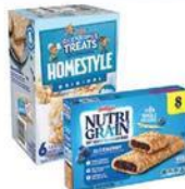
Kellogg's Nutri-Grain Bars 8 Ct. Rice Krispies Treats Homestyle 6 Ct.