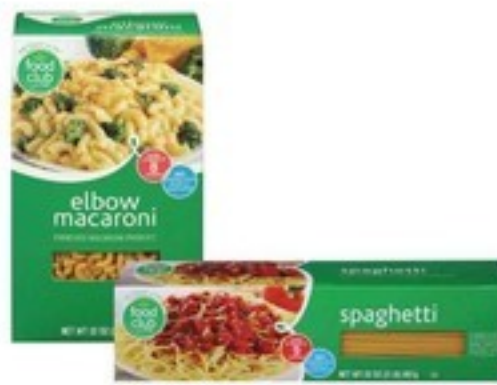
FOOD CLUB PASTA spaghetti or elbow macaroni 32 oz.