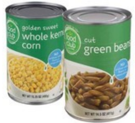
FOOD CLUB VEGETABLES select varieties 14.5-15.25 oz.