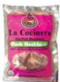
LA COCINERA PORK NECK BONES 2 lb.