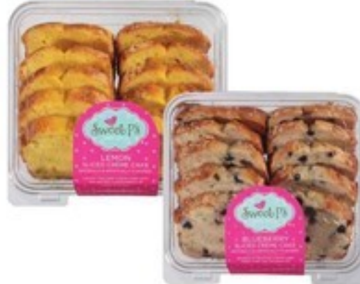
SWEET P'S BAKE SHOP SLICED LOAF CAKES select varieties 16 oz.