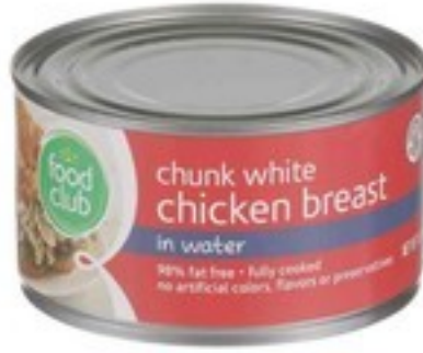
FOOD CLUB CHUNK WHITE CHICKEN BREAST in water 12.5 oz.