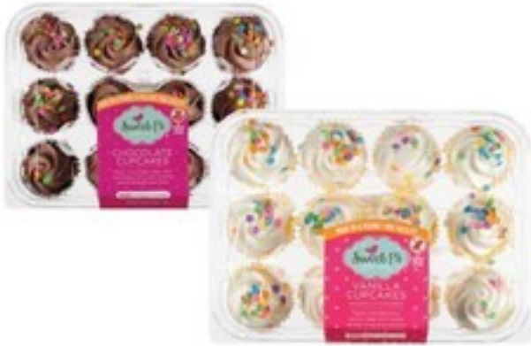
SWEET P'S BAKE SHOP MINI CUPCAKES select varieties 10 oz.