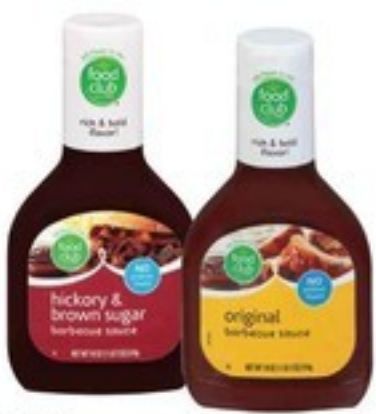
FOOD CLUB BARBECUE SAUCE select varieties 18 oz.