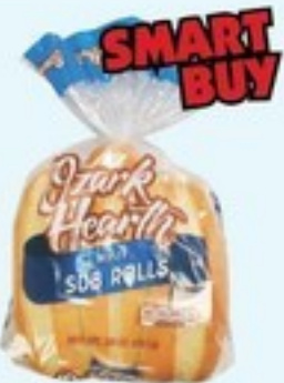
SMART BUY OZARK HEARTH WHITE SUB ROLLS 6 ct.