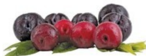
PLUMS red or black