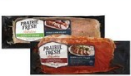
PRAIRIE FRESH BONELESS LOIN FILLETS select varieties 27.2 oz.