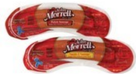
JOHN MORRELL SMOKED SAUSAGE select varieties 7 oz.