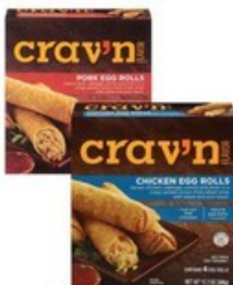
CRAV'N FLAVOR EGG ROLLS select varieties 12.2 oz.