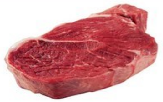
ARM ROAST family pack boneless beef single pack $6.99/lb.