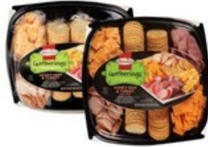
HORMEL GATHERINGS PARTY TRAYS select varieties 28 oz.