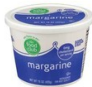
FOOD CLUB MARGARINE 15 oz. tub