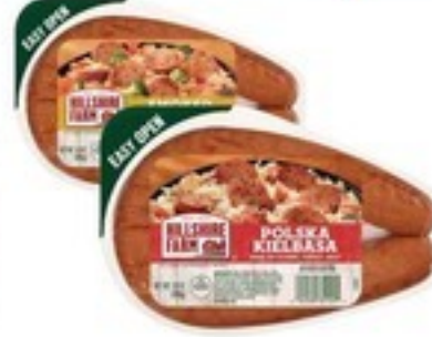
HILLSHIRE FARM SMOKED SAUSAGE select varieties 12-14 oz.