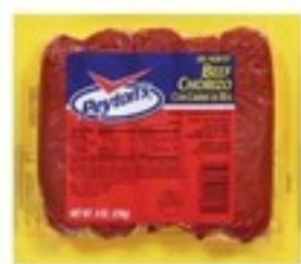
PEYTON'S CHORIZO select varieties 8 oz.