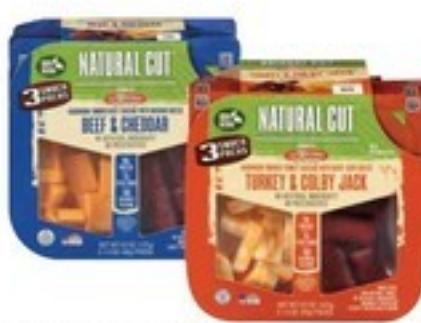
OLD WISCONSIN SNACK TRAYS select varieties 4.5 oz.