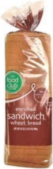
FOOD CLUB ENRICHED SANDWICH WHEAT BREAD 24 oz.