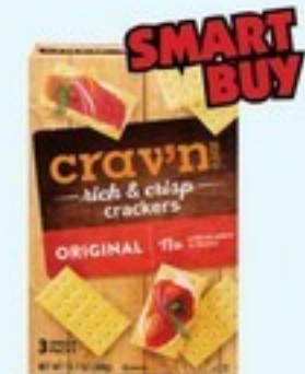
SMART BUY CRAV'N FLAVOR SNACK CRACKERS select varieties 12.5-13.7 oz.