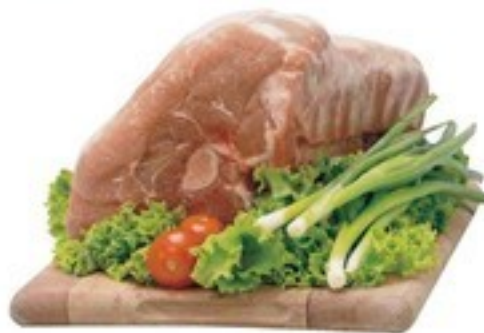
FRESH BONE IN PORK SIRLOIN ROAST