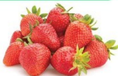
STRAWBERRIES 1 lb.