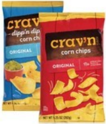
CRAV'N FLAVOR CORN CHIPS select varieties 9.25 oz.