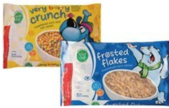
FOOD CLUB CEREAL select varieties 28-32 oz.