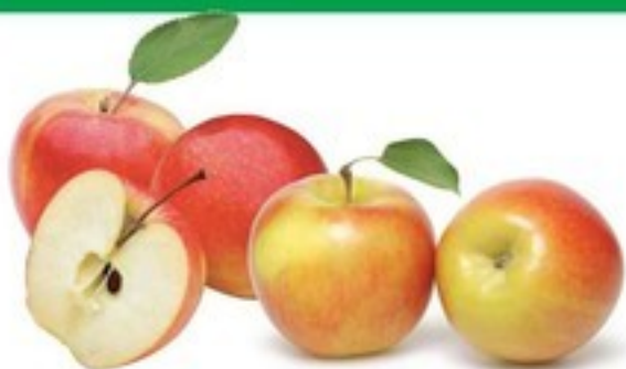
APPLES red delicious, fuji or gala 3 lb. bag