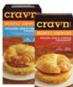
CRAV'N FLAVOR BREAKFAST SANDWICHES select varieties 2 ct.