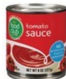
FOOD CLUB TOMATO SAUCE 8 oz.