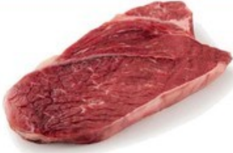
ARM STEAK family pack boneless beef