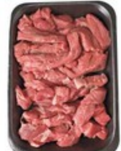
MARINATED BEEF FAJITAS