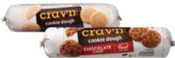
CRAV'N FLAVOR COOKIE DOUGH chocolate chip or sugar 16.5 oz.