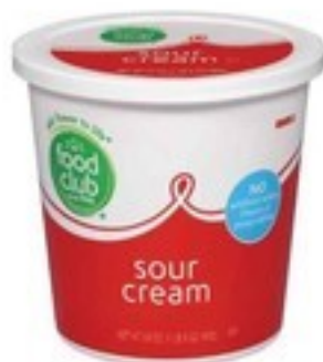
FOOD CLUB SOUR CREAM 24 oz.