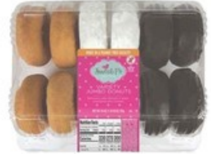
SWEET P'S BAKE SHOP VARIETY JUMBO DONUTS 26 oz.