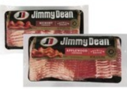
JIMMY DEAN BACON select varieties 12 oz.