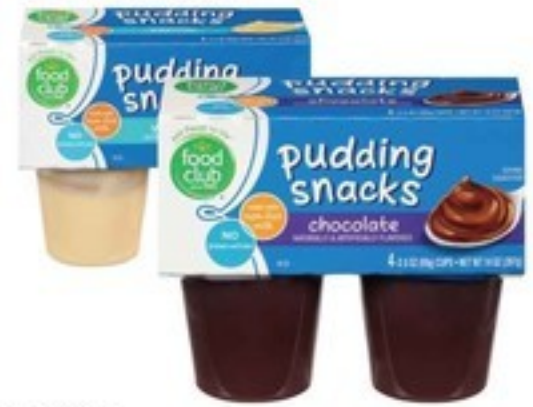
FOOD CLUB PUDDING SNACKS select varieties 4pk/3.5 oz.