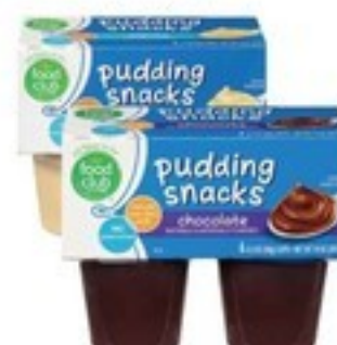
FOOD CLUB PUDDING SNACKS select varieties 4pk/3.5 oz.