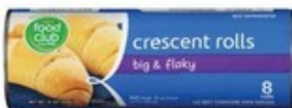
FOOD CLUB BIG AND FLAKY CRESCENT ROLLS 8 ct.