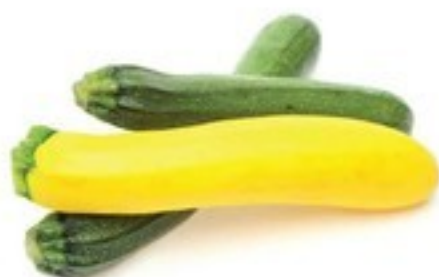
SQUASH yellow, zucchini or mexican grey