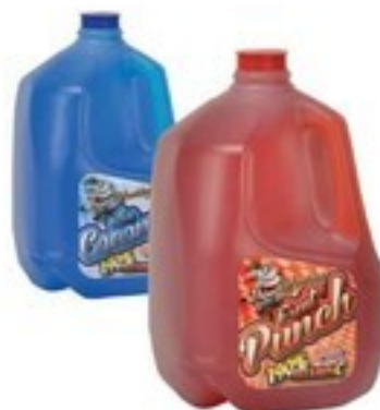
PLAINS PUNCH select varieties gallon