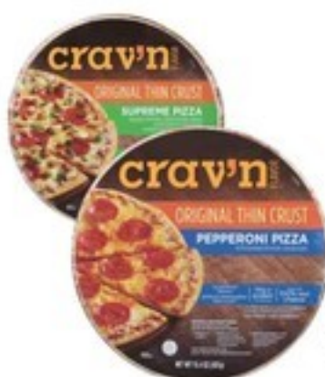
CRAV'N FLAVOR ORIGINAL THIN CRUST PIZZA select varieties 14.5-16.9 oz.