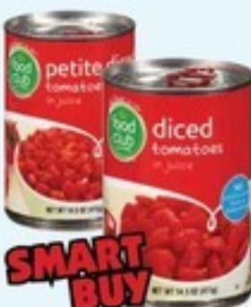
SMART BUY FOOD CLUB TOMATOES select varieties 14.5-15 oz.