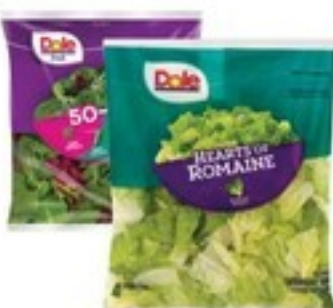
DOLE SALAD MIXES select varieties 5-9 oz.