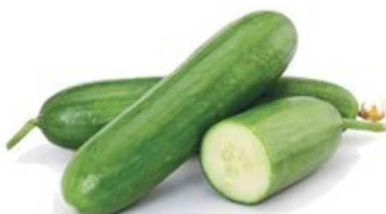
SUPER SELECT CUCUMBERS farm fresh