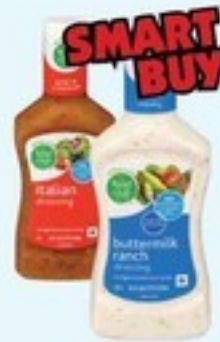
SMART BUY FOOD CLUB SALAD DRESSING select varieties 16 oz.