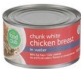
FOOD CLUB CHUNK WHITE CHICKEN BREAST in water 12.5 oz.