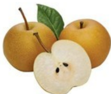
ASIAN APPLE PEARS