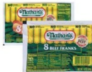
NATHAN'S BEEF FRANKS select varieties 12-14 oz.