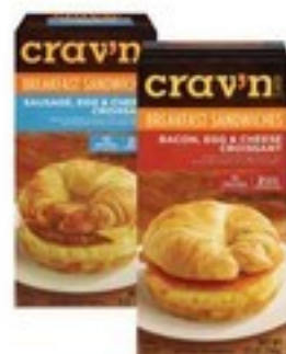
CRAV'N FLAVOR BREAKFAST SANDWICHES select varieties 2 ct.