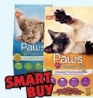
SMART BUY PAWS HAPPY LIFE CAT FOOD select varieties 3.15 lb.