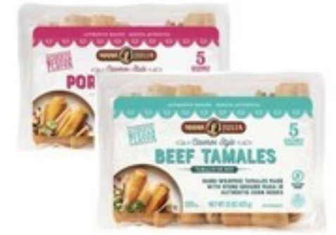
MAMA JULIA TAMALES select varieties 15 oz.