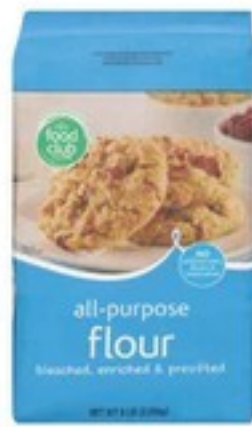
FOOD CLUB ALL PURPOSE FLOUR 5 lb.