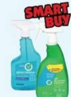
SMART BUY SIMPLY DONE CLEANER all purpose or glass 32 oz.