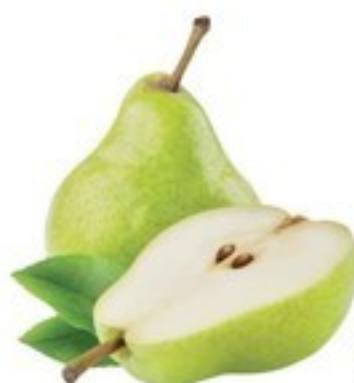
BARTLETT PEARS large