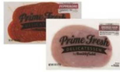
PRIME FRESH DELICATESSEN MEAT select varieties 7-8 oz.