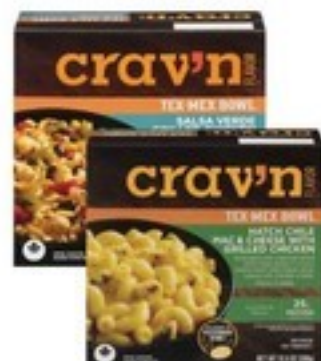
CRAV'N FLAVOR TEX MEX BOWLS select varieties 10-10.6 oz.