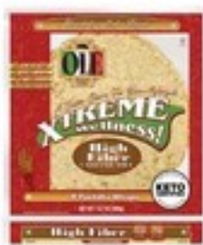
OLE XTREME WELLNESS! TORTILLAS select varieties 8 ct.