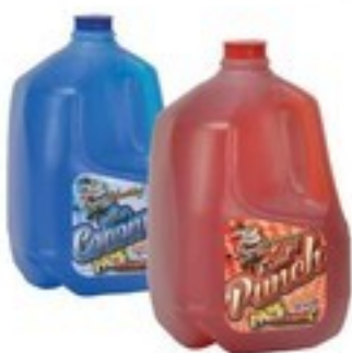
PLAINS PUNCH select varieties gallon