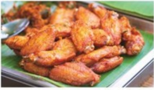
BUFFALO STYLE HOT WINGS