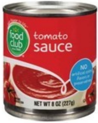
FOOD CLUB TOMATO SAUCE 8 oz.