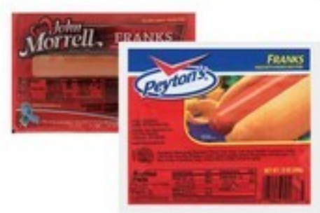
JOHN MORRELL OR PEYTON'S MEAT FRANKS select varieties 12 oz.