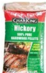
CHARKING HARDWOOD PELLETS select varieties 20 lb.