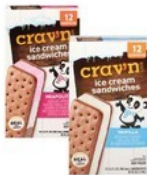
CRAV'N FLAVOR ICE CREAM SANDWICHES select varieties 12-16 pk.