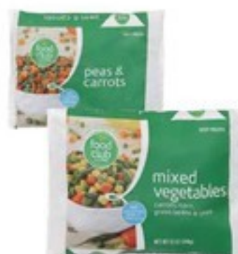
FOOD CLUB VEGETABLES select varieties 12 oz.