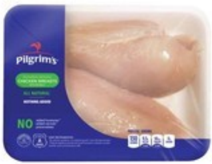
PILGRIM'S CHICKEN BREAST boneless skinless