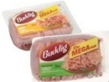
BUDDIG LUNCH MEAT select varieties 22 oz. mega pack