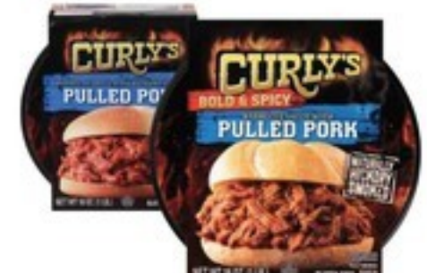
CURLY'S PULLED PORK select varieties 16 oz.