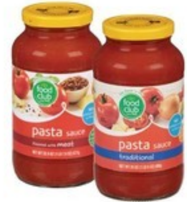
FOOD CLUB PASTA SAUCE select varieties 23.75-24 oz.