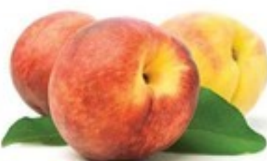
PEACHES OR NECTARINES