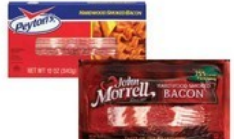
PEYTON'S OR JOHN MORRELL SMOKED BACON select varieties 12 oz.