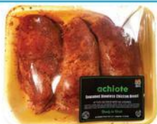
DRY RUB SEASONED BONELESS CHICKEN BREAST 4 flavors