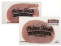
PRIME FRESH LUNCH MEAT select varieties 7-8 oz.