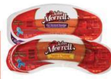
JOHN MORRELL SMOKED SAUSAGE 7 oz. regular, hot or polish