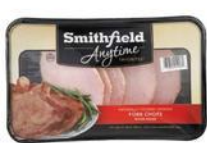
SMITHFIELD ANYTIME PORK CHOPS 17 oz. bone in hickory smoked