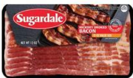
SUGARDALE SLICED BACON 12 oz.