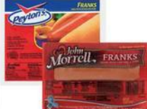
PEYTON'S OR JOHN MORRELL MEAT FRANKS 12 oz.