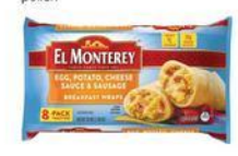
EL MONTEREY BREAKFAST WRAPS select varieties 8 pack