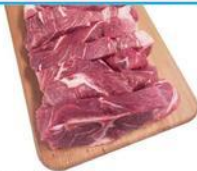
PORK SHOULDER COUNTRY STYLE RIBS OR PORK STEAK