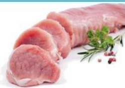
BONELESS PORK TENDERLOIN