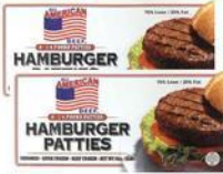
ALL AMERICAN BEEF HAMBURGER PATTIES 2 lb. 100% beef