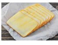
MUENSTER CHEESE (approx 6 lb. loaf available in the meat department)