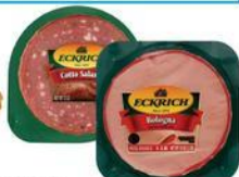
ECKRICH MEAT BOLOGNA OR COTTO SALAMI 14 oz.