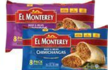
EL MONTEREY CHIMICHANGAS OR BURRITOS select varieties 32 oz.