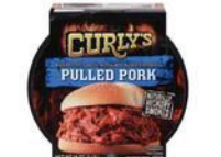
CURLY'S PULLED PORK select varieties 16 oz.