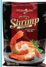
CHICKEN OF THE SEA COOKED SHRIMP 1 lb. bag 61/70 p&d