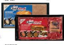
GARY'S QUICK STEAK chicken breast or 100% sirloin steak 10.8 oz.