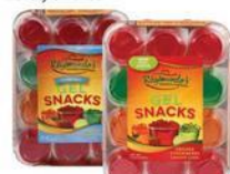
RAYMUNDO'S GELATIN select varieties 12ct/3.5oz.