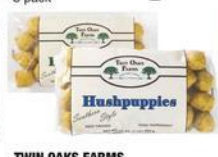
TWIN OAKS FARMS SOUTHERN STYLE HUSHUPPIES 1 lb. original or jalapeno