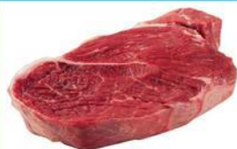
BEEF SHOULDER ROAST preferred trim boneless