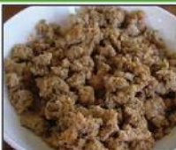
Fresh Store Made Bulk Sausage Hot, Sweet or Breakfast