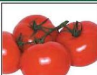
Tomatoes On The Vine