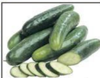
Super Select Cucumbers