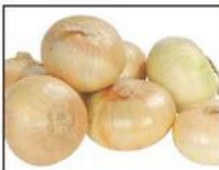
Vidalia Sweet Onions