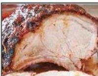
Bone-In Pork Loin Roast