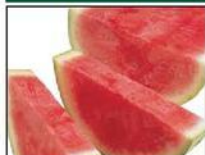
Whole Seedless Watermelons