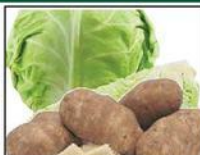
Large Green Cabbage Or Jumbo Baking Potatoes