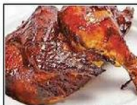
Fresh Grade A Half Chickens Original Or Seasoned