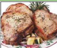
Family Pack Bone-In Center Cut Pork Chops