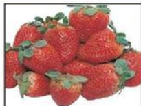
Red Ripe Strawberries