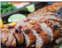
Smithfield Boneless Pork Tenderloins