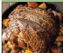
Certified Angus USDA Choice Boneless Beef Chuck Roast