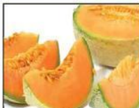
Sweet Jumbo Cantaloupe