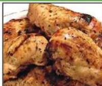
Family Pack Boneless Skinless Chicken Breast