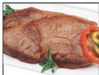
Certified Angus USDA Choice Boneless Beef Chuck Steak