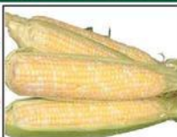
Florida Bi-Color Sweet Corn