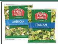
Fresh Express Italian, American Or Sweet Butter Salads