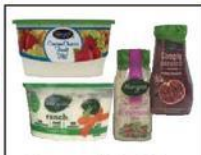
Marzetti Dips Or Dressings