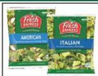
Fresh Express Italian, American Or Sweet Butter Salads