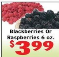
Blackberries Or Raspberries 6 oz.