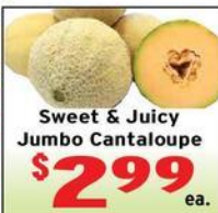
Sweet & Juicy Jumbo Cantaloupe