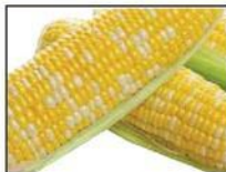
Florida Bi-Color Sweet Corn