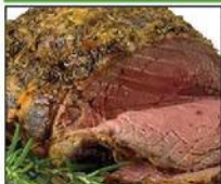
Certified Angus Boneless Beef Sirloin Tip Roast