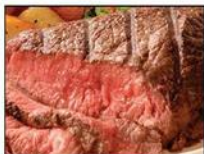
Certified Angus 93% lean ground Beef or Sirloin Tip Steaks