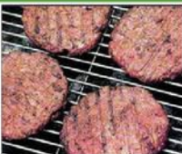
Family Pack 80% Lean Ground Beef