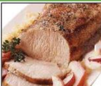
Whole Boneless Pork Loins