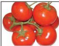
Tomatoes On The Vine