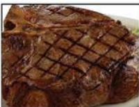
Certified Angus Porterhouse or T-Bone Steaks