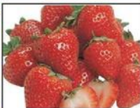
Red Ripe Strawberries 1 lb.