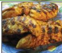
Family Pack Fresh Grade A Boneless Chicken Tenders