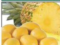
Sweet Ripe Golden Pineapple Or 2 lb. Bag Lemons