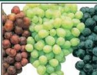
Red, Green Or Black Seedless Grapes