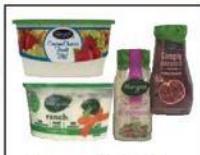
Marzetti Dips Or Dressings