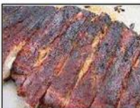
Previous Frozen Pork Spare Ribs