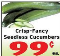
Crisp-Fancy Seedless Cucumbers