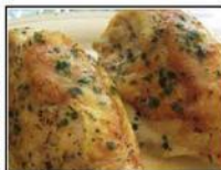
Amish Gerber All Natural Boneless Skinless Chicken Breast