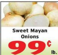
Sweet Mayan Onions