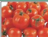
Crunchy Sweet Cherry Tomatoes Pint