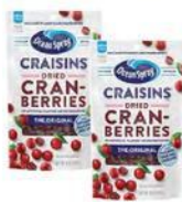
Ocean Spray Craisins 5 - 6 oz.