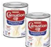
Carnation Evaporated Milk 12 oz.