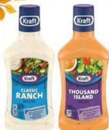
Kraft Dressing 14 - 16 oz.

Our selection of top-quality groceries along with Lincoln's widest range of specialty items makes Leon's perfect for everyday shoppers and foodies alike.