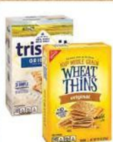
Nabisco Snack Crackers 3.5 - 8.5 oz.