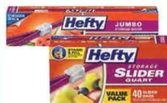
Hefty Slider Bags 12 - 40 Ct.