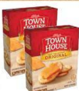
Kellogg's Town House Crackers 9 - 13.8 oz.