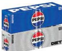
12 Pack Pepsi Products 12 oz. Cans