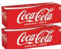
12 Pack Coke Products 12 oz. Cans