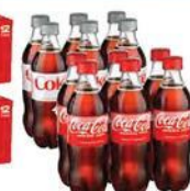
6 Pack Coke Products 500 mL Bottles