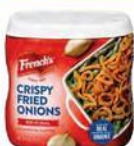
French's Crispy Fried Onions 6 oz.