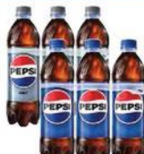
6 Pack Pepsi Products .5 Liter Bottles