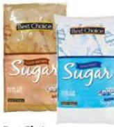
Best Choice Powdered or Brown Sugar 2 Lb. Bag