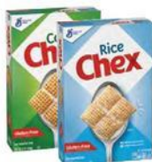
General Mills Chex Cereal 12 - 14 oz.