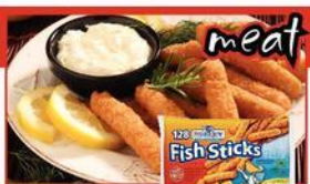
Fisher Boy Fish Sticks 60 Oz.