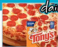
Tony's Pizza or Bibigo Dumplings 6.6-20.13 Oz. Selected Varieties