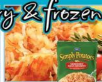
Simply Potatoes 20 Oz. Selected Varieties