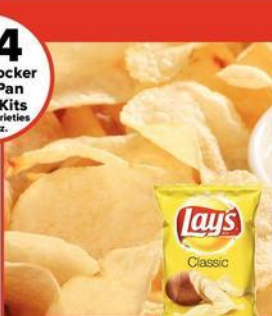
2/$6 Frito-Lay Classic Chips 5-8 Oz. Selected Varieties