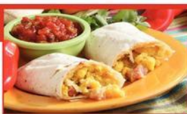
Jimmy Dean Breakfast Burritos Rolls or Wraps 12.8-17 Oz. Selected Varieties