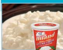
Hiland Cottage Cheese 24 Oz. Selected Varieties