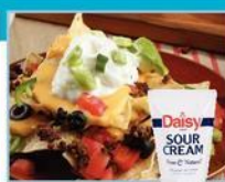
Daisy Sour Cream or Cottage Cheese 14-16 Oz. Selected Varieties