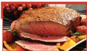
Top Round Roast Fresh Boneless Beef