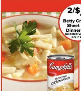
Campbell's Soup 10.5-11.25 Oz. Selected Varieties