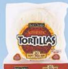
Best Choice Flour Tortillas 20 Ct.