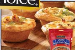
Best Choice French Fried Onions 3 Oz. Bag