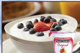
Best Choice Yogurt 6 Oz., Selected Varieties