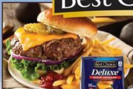
Best Choice Deluxe Sliced American Cheese 16 Oz.