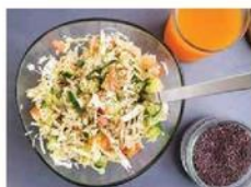
DELI FRESH MEDITERRANEAN SLAW $4 98 Lb.