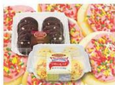
LOFTHOUSE COOKIES $3 98 Asst., 10 Ct.