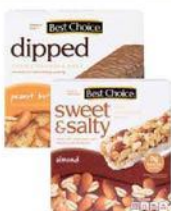
Best Choice Granola Bars 6 - 10 Ct.