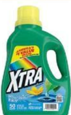
Xtra Liquid Laundry Detergent 56 - 67.5 oz.