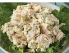
DELI FRESH CHICKEN SALAD $6 98 Lb.