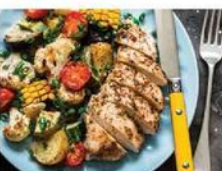
DELI FRESH SEARED SEASONED CHICKEN BREAST $3 48 Ea.