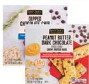
Best Choice Superior Selections Protein or Dipped Granola Bars 5 - 6 Ct.