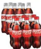
6 Pack Coca-Cola Products 16.9 oz. Bottles