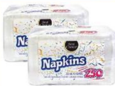
Best Choice White Napkins 250 Ct.