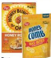
Post Cereal, Crisps, or Big Bite Snacks 6 - 14.75 oz.