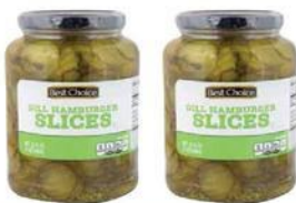
Best Choice Hamburger Sliced Pickles 32 oz.