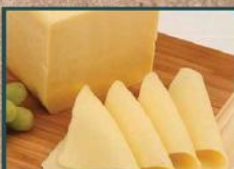
BOAR'S HEAD SMOKED GOUDA $8 98 Lb.