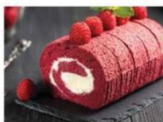
DELI FRESH RED VELVET SWISS ROLLS $2 98 Ea.