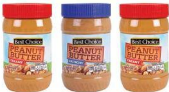
Best Choice Peanut Butter 16 oz.