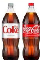
Coca-Cola Products 2 Liter Bottles