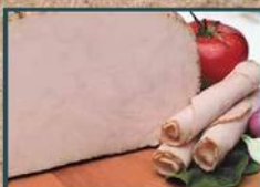
BOAR'S HEAD MESQUITE SMOKED TURKEY $10 98 Lb.

One of Lincoln's first in-store delis, Leon's provides only the finest Boar's Head meats and cheeses, along with delicious ready-to-eat items from our hot case.