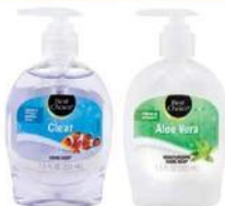
Best Choice Hand Soap 7.5 oz.