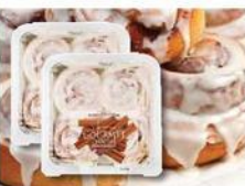
J. SKINNER GOURMET CINNAMON ROLLS $4 98 4 Ct.