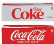
12 Pack Coca-Cola Products 12 oz. Cans