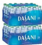
24 Pack Dasani Drinking Water 16.9 oz. Bottles