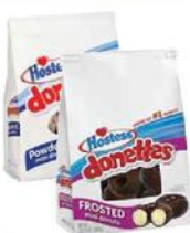
Hostess Donettes Mini Donuts 9.5 - 11.25 oz.