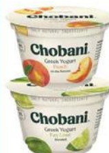
Chobani Greek Yogurt 5.3 oz.