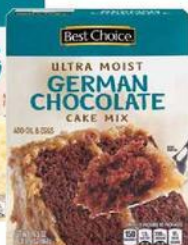
Best Choice Ultra Moist Cake Mix 16.5 oz.