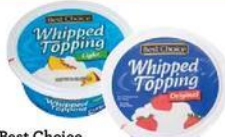
Best Choice Whipped Topping 8 oz.