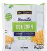
Best Choice Steamable Vegetables 12 oz.