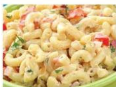
DELI FRESH MACARONI SALAD $2 98 Lb.

HAM MEAL INCLUDES: 3 Lbs. Real Mashed Potatoes 2 Lbs. Gravy 3 Lbs. Traditional Stuffing 3 Lbs. Green Bean Casserole 12 Dinner Rolls 8 Inch Pie