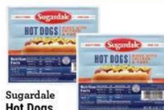
Sugardale Hot Dogs 16 oz.

CHRISTMAS SCANDINAVIAN FAVORITES ESSENTIALS