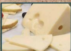
BOAR'S HEAD BABY SWISS CHEESE $7 98 Lb.