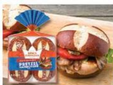
KING'S HAWAIIAN PRETZEL BUNS $3 98 Ea.