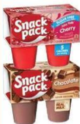
Snack Pack Pudding Cups or Juicy Gels 4 Pack