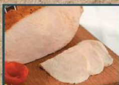
BOAR'S HEAD OVEN GOLD TURKEY $10 98 Lb.

One of Lincoln's first in-store delis, Leon's provides only the finest Boar's Head meats and cheeses, along with delicious ready-to-eat items from our hot case.