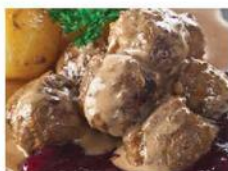
DELI FRESH SWEDISH MEATBALLS $5 98 Lb.