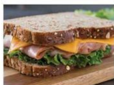
DELI FRESH HAM & CHEESE SANDWICH $3 98 Ea.