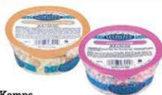
Kemps IttiBitz Ice Cream 2.9 oz.