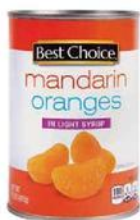
Best Choice Mandarin Oranges 15 oz.