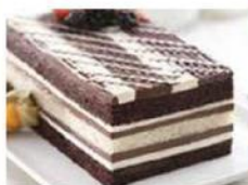
DELI FRESH TRIPLE CHOCOLATE TIGER CAKE $3 98 Ea. Slice