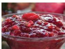
DELI FRESH LINGONBERRY SAUCE $6 98 Lb.