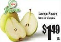
Large Pears base or d'anjou