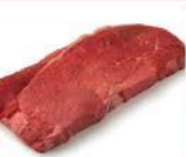
Choice Boneless Beef Top Round Steak