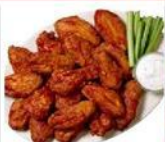
Buffalo Style Hot Wings