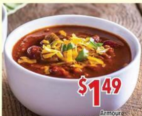
Armour Chili with Beans 14 oz.