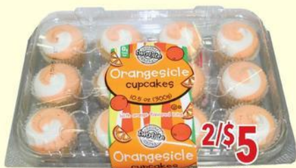
Two-Bite Cupcakes 12 ct.