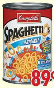
Campbell's Spaghetti or Spaghetti's 15.8 oz.