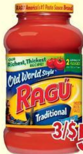
Ragu Pasta Sauce 16-24 oz.