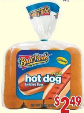
Ball Park Hamburger or Hot Dog Buns 8 ct.