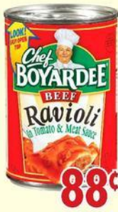
Chef Boyardee Pasta 14.5-15 oz.