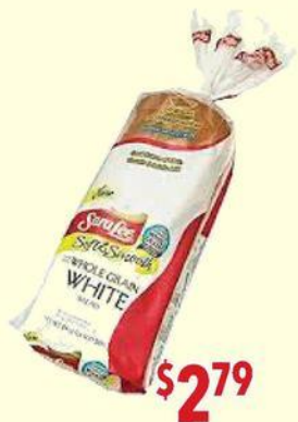
Sara Lee Whole Grain White Bread 20 oz.