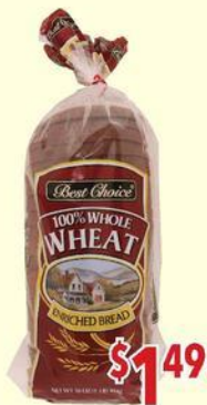
Best Choice 100% Whole Wheat Bread 16 oz.