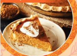
Pumpkin Pie and Pumpkin Rolls!

Kraft Jet-Puffed Marshmallows 8-10 Oz., Selected Varieties 99¢