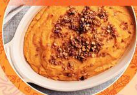
Sweet Potato Casserole with Warm Crescent Rolls