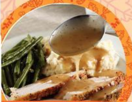
Mashed Potatoes with Steamed Vegetables

GIVE THANKS WITH THESE SEASONAL SAVINGS!